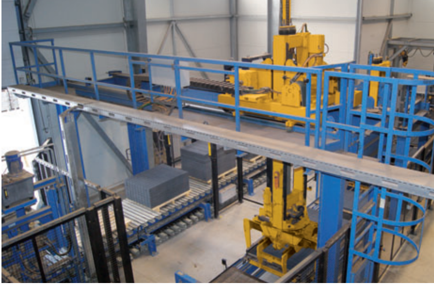
Servo packet assembler

on, an amplitude change can even be made during production. The rugged and simple design of the vibration system guarantees their long lifetime.