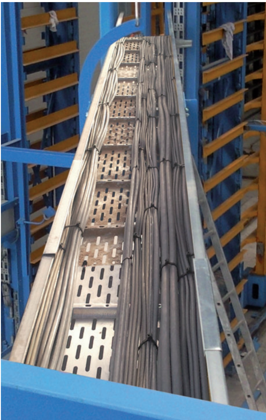
Cable routing via cable trays

After packaging, the packets are strapped horizontally and vertically. The packaged products are transported by a slat conveyor to the outdoor area. They are then taken by fork-lift truck to the storage yard. Masa AG has very recently changed its plants in particular from hydraulic to servo-drive technology. The plants are thus more environmentally friendly than conventional hydraulic plants, since the use of hydraulic oils and the associated environmental impacts can