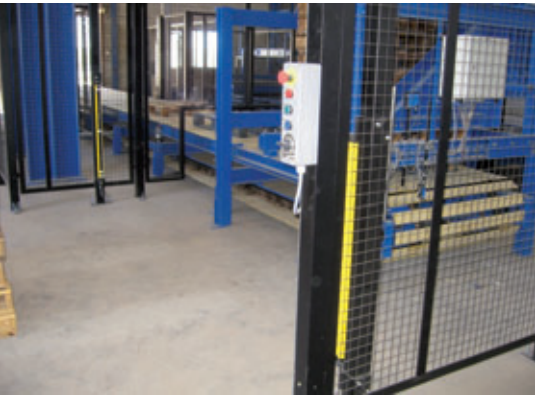
Light curtain/light barrier