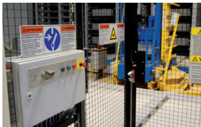
Safety interlock systems for the safe opening of doors – in combination with local release terminals for plant safety