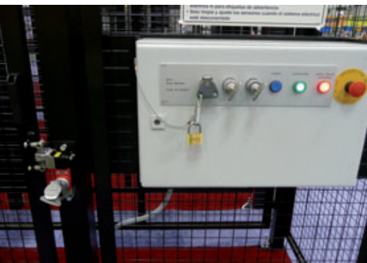
Securing method using a personal padlock

standable and comprehensive safety documents. Masa supplies explanatory technical operating instructions for each plant component that also provide important plant safety instructions. Beyond that, Masa has prepared comprehensive safety materials. These consist of written safety documentation and a safety video. The safety documentation initially describes the locations of potential hazards in the plant. These include, for example, dangers of being crushed and cut, electric shocks, fire or injuries due to falling. Furthermore, there is an explanation of why accidents occur, how safety precautions are complied with and how certain ('wrong') decisions can lead to hazards. In a further section, information is given on how to pre-