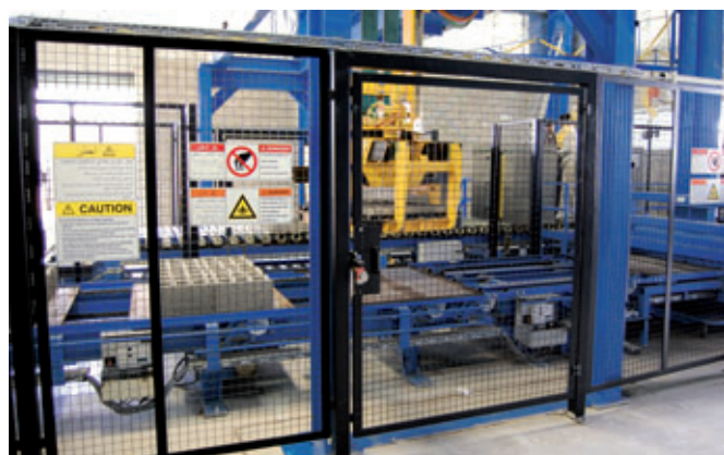
Signs and other safety-relevant notices on plant components are decisive for the employees' safety understanding and sensitise them to possible sources of danger.

An important component in the creation of the Masa safety concept, apart from the internal risk evaluation and minimisation, is also the transfer of these findings to under-