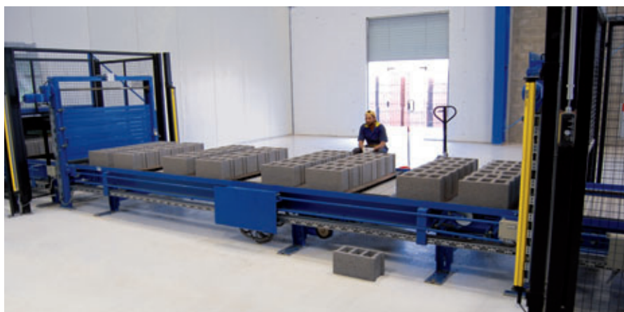
Quality control at Masa: boring with certainty.

Masa GmbH Masa-Str. 2 56626 Andernach, Germany T +49 2632 92920 F +49 2632 929211 info@masa-group.com www.masa-group.com