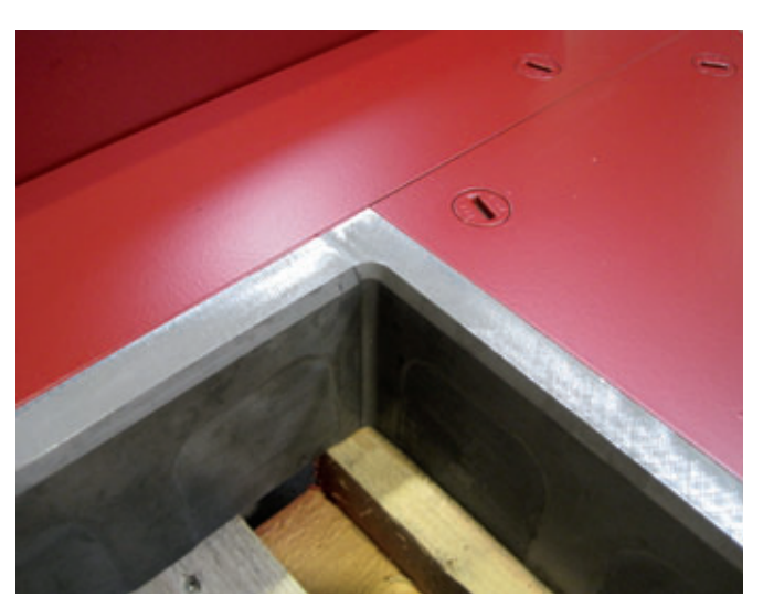
Fig. 5: Mould corner with innovative single walls in standard hardness 68 HRC