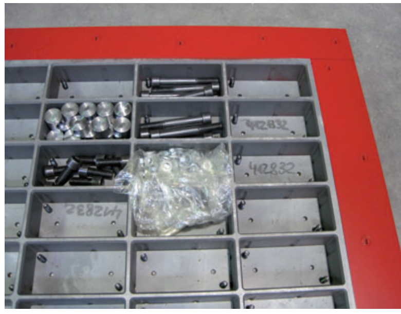
Fig. 2: »Moduline2« mould bottom with separately delivered tamper shoes and mounting kit for bolted flanges