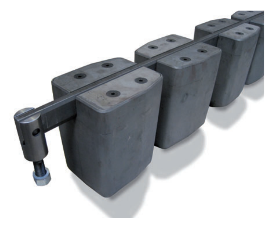
Fig. 3: The innovative core bar assembly for standard hollow block moulds with »carbo«-hardened, single-bolted steel cores

design. The weak points of conventional concrete block moulds have been recognised and eliminated as far as possible. Kobra took the consistent step to the fully milled, hardened concrete block mould as early as 2000 and has shaped the technological term »Longlife« for several years. Only with the »Longlife« moulds from Kobra were the necessary structural conditions created in the mould bottom in order to be able to turn the advantages of the highest hardness standard (68 HRC) into an effective extension of the mould service life. The »Longlife« principle – durable hardness without weak points – encompasses the