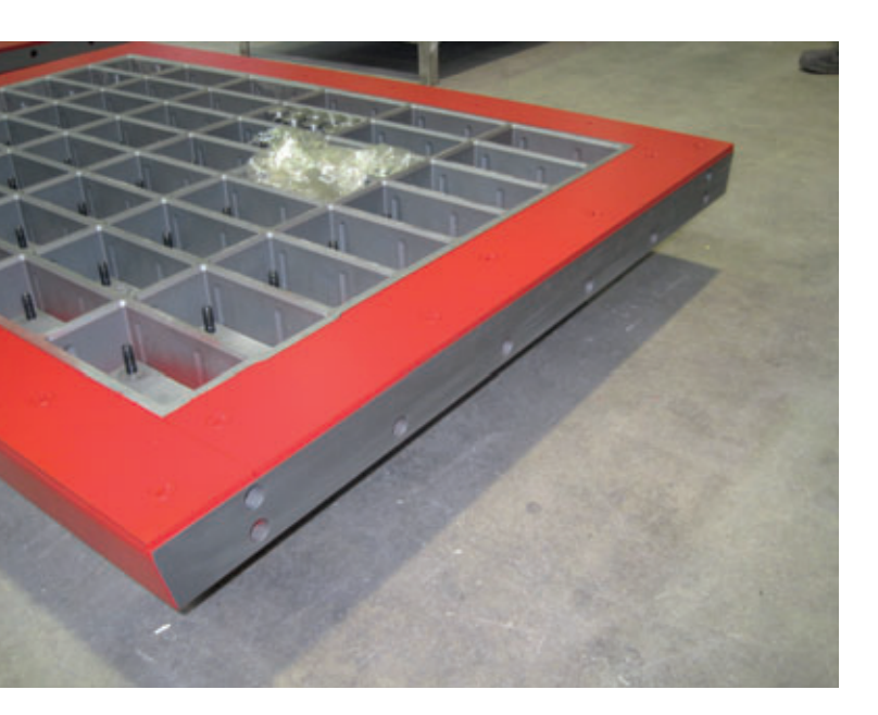
Fig. 1: Delivery condition of the »Moduline2« mould bottom with self-assembly of the bolted flanges by the customer

For several years now, Kobra has been moving ever further away from unnecessary weld seams in the mould bottom towards bolted mould technologies in the interests of a practically-orientated product