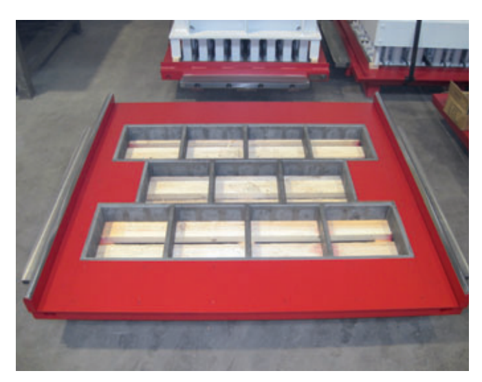
Fig. 4: »Moduline1« paving stone mould with offset layout

KOBRA Formen GmbH Plohnbachstraße 1 08485 Lengenfeld, Germany T +49 37606 3020 F +49 37606 30222 info@kobragroup.com www.kobragroup.com