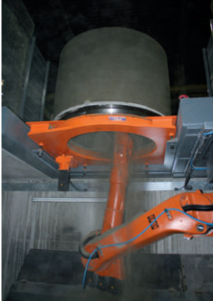
Milling the channels from below

inlets and outlets for any desired pipe connection is fully automatic with the Primuss production method. Mould expenditure is minimised as a result of early demoulding and short throughput times. Just four moulds are in use at Rinninger for the monolith production.