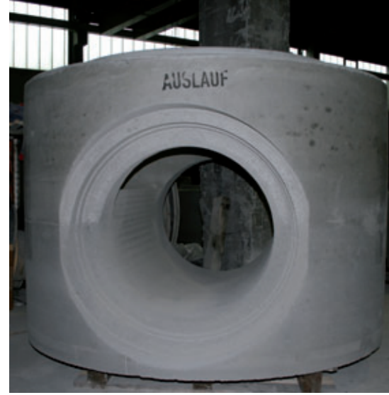
Milled manhole base, NW 1,200 mm, overall height 1,400 mm with milled connections and channels for FBS concrete pipes, NW 800 mm