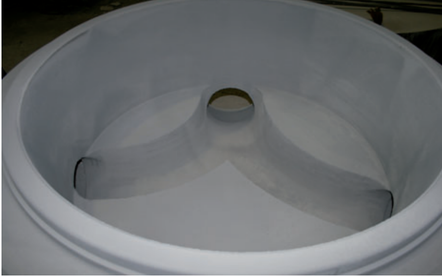
Finished concrete manhole base