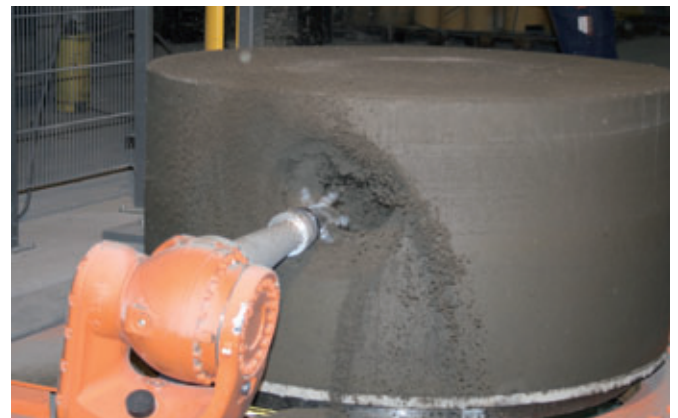
Milling the side connections