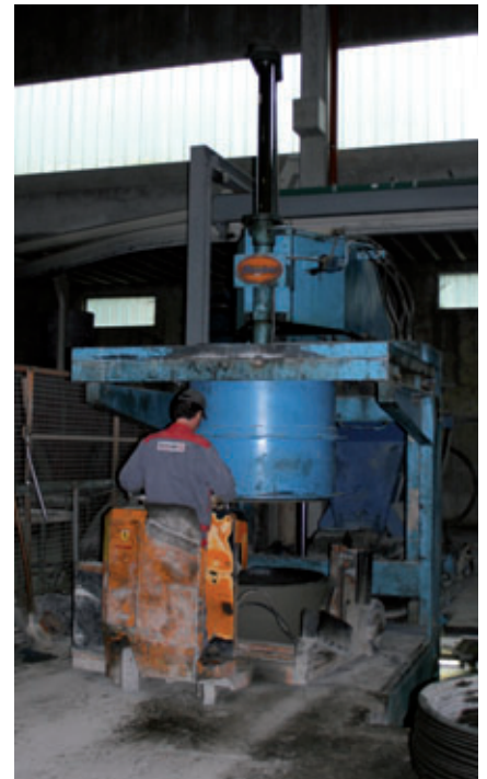
Prinzing machine for manhole ring production, manufactured in 1982

The Rinninger company has established a quality assurance system that helps to permanently maintain the high quality standards. The monitoring of the recipes and the aggregates for the concrete products is carried out in the in-house research laboratory by two concrete technologists. The quality of the products is continuously monitored by these experienced employees during the production process. The results are concrete products with a maximum of functional reliability and an appealing look. Quality expertise is ensured by long-standing memberships in the Concrete and Precast Quality Auditing Associations and