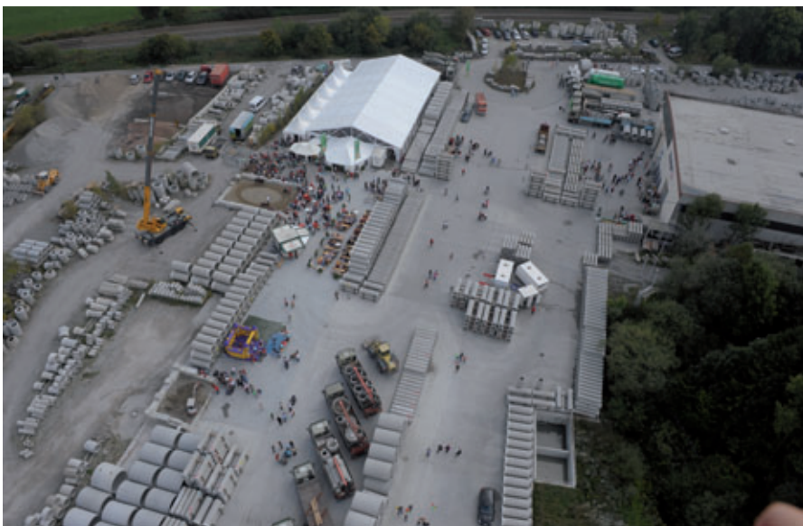
View of the production site of Hans Rinninger u. Sohn GmbH u. Co. KG in Kisslegg during the celebration to mark the 100 th anniversary of the company