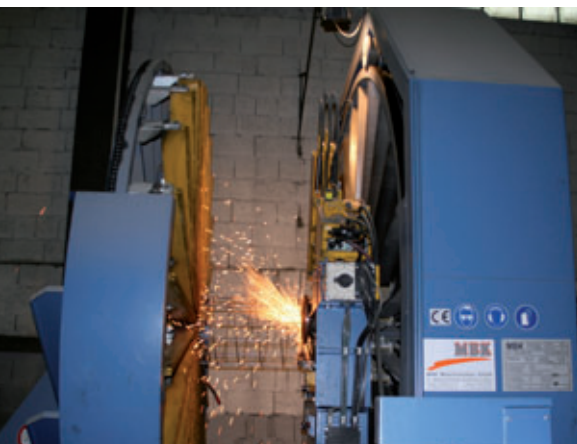
New reinforcement welding machine from MBK

Such product variety necessitates a large number of production plants. Hence Rinninger has amassed an impressive machine pool over the years. Apart from care and maintenance, the plants are renewed or equipment parts from a production line are replaced or added if necessary.