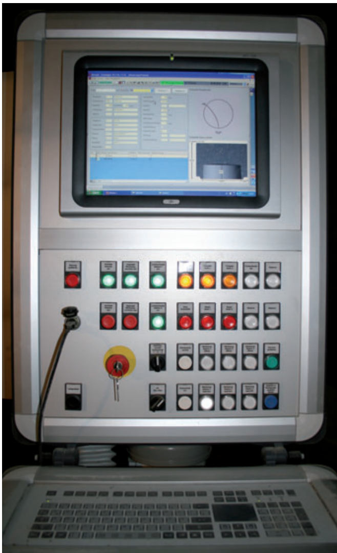
Control panel directly on the milling station

The concrete removed during the milling procedure falls down freely and is removed fully automatically from the plant. For this purpose, steeply aligned skid plates were mounted under the machining station, via which the material slides onto a permanently running conveyor belt. The conveyor belt takes the material to a second con-