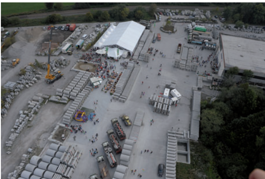
View of the production site of Hans Rinninger u. Sohn GmbH u. Co. KG in Kisslegg during the celebration to mark the 100 th anniversary of the company

Jörg Rinninger joined the company in 2005 as the 4th generation. In the same year the underground construction division was supplemented by a modern plant for the manufacture of large pipes in diameters up to 2.50 m. 2007 saw the market introduction of the Topliner system, a manhole system with integrated seal and integrated load transfer. This system succeeded in saving time and personnel in the assembly of manhole systems. With the aid of seals integrated in the manhole system and built-in load transfer, the assembly time can be shortened significantly and the number of fitters redu-