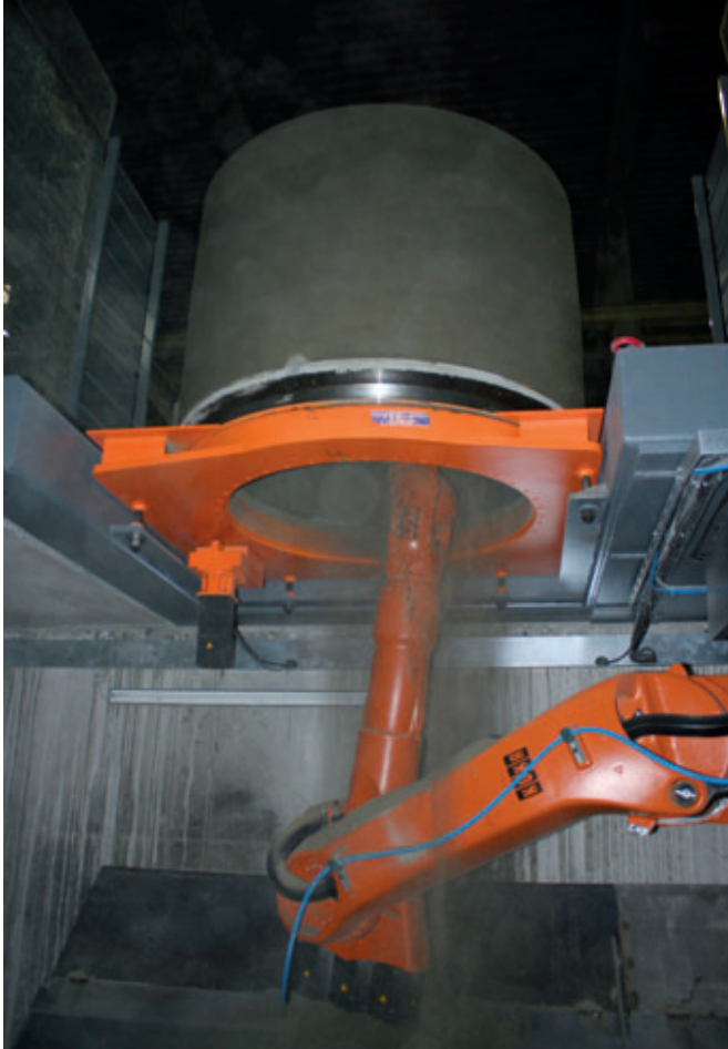
Milling the channels from below

(C 60/75) and a low water cement ratio or from high performance concrete. Thanks to the high degree of automation of the plant, only one employee is required to monitor the production process.