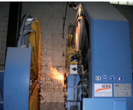
New reinforcement welding machine from MBK

A long-standing partnership with Prinzing GmbH precedes the investment in the new Primuss production system. Besides the new plant, Rinninger operates two other production machines from Prinzing. The plants concerned are for the production of manhole rings. One of the plants was installed in 1982 and has thus been producing manhole rings in Kisslegg for almost 30 years.