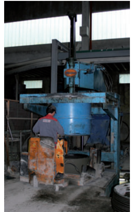
Prinzing machine for manhole ring production, manufactured in 1982

On average Rinninger processes over 1,000 tonnes of sand or gravel and up to 250 tonnes of cement per day, which, mixed in a total of five mixing machines, are processed to make various concrete products, e.g. steel reinforced concrete pipes, manhole systems, stairs, balconies, slot channels, precast slabs with in-situ topping,