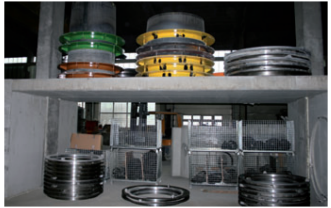
Support core and sleeve magazine