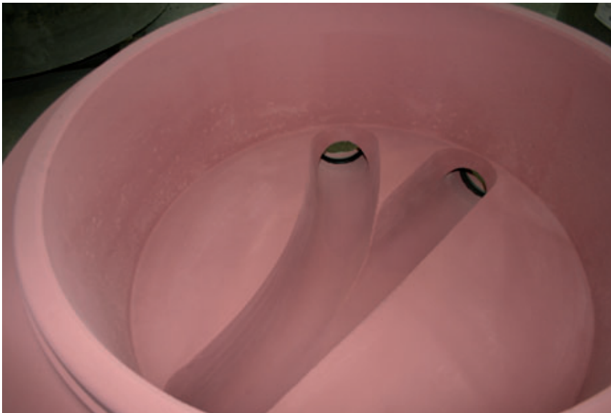
Primuss Pro manhole base

or less than 5 mm (Primuss Pro) at the surface, can face up to competing products. The quality of the later product directly depends on the quality of the concrete used. Primuss Pro manhole bases, for example, are manufactured from high-strength C 90/105 concrete. The aforementioned quality assurance at Rinninger guarantees the customer high-quality concrete products that can measure up to the positive characteristics of plastic surfaces.