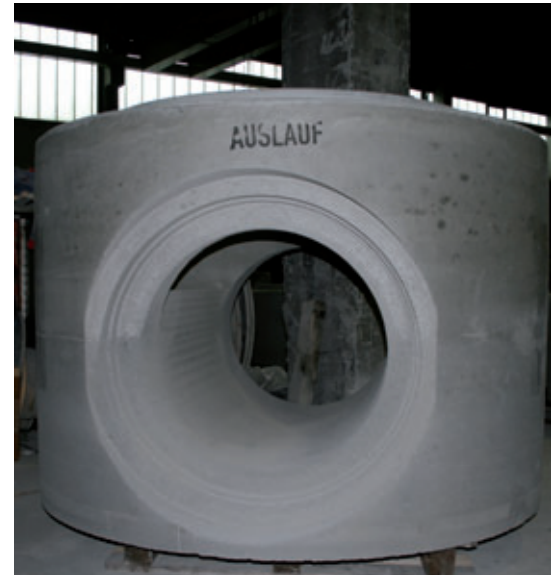
Milled manhole base, NW 1,200 mm, overall height 1,400 mm with milled connections and channels for FBS concrete pipes, NW 800 mm