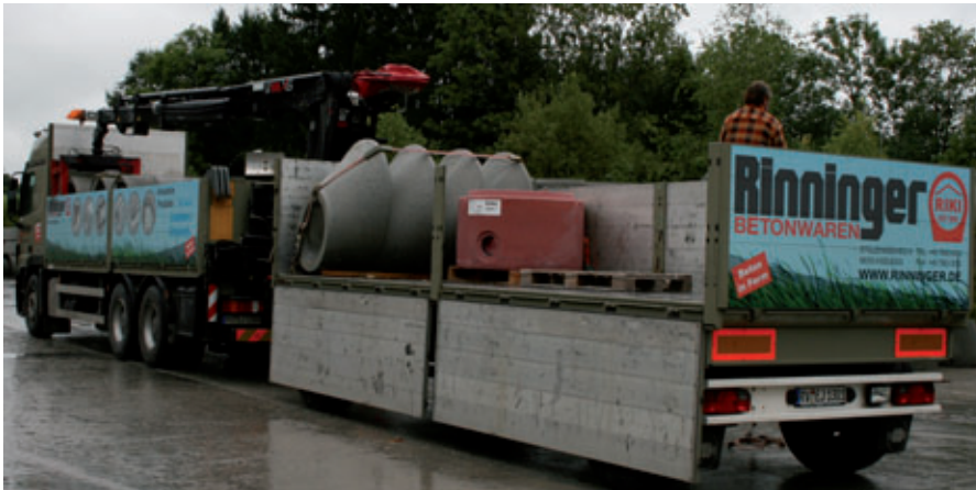
With 25 vehicles of its own, Rinninger is able to accommodate special customer requests at very short notice

ced in comparison with conventional manhole systems. Thanks to this innovation, errors during the installation on the building site are virtually impossible.