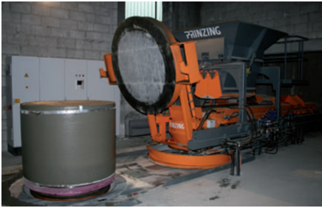
The concrete manhole monoliths are produced by the proven Atlas machine