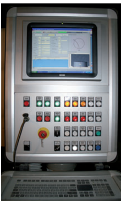
Control panel directly on the milling station