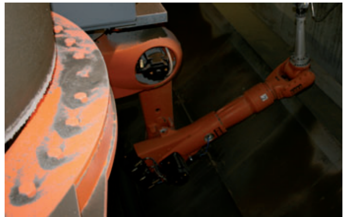
The pit under the machining stations serves as the movement area for the milling robot