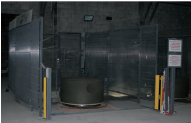
The Primuss milling station has two floor-level machining stations