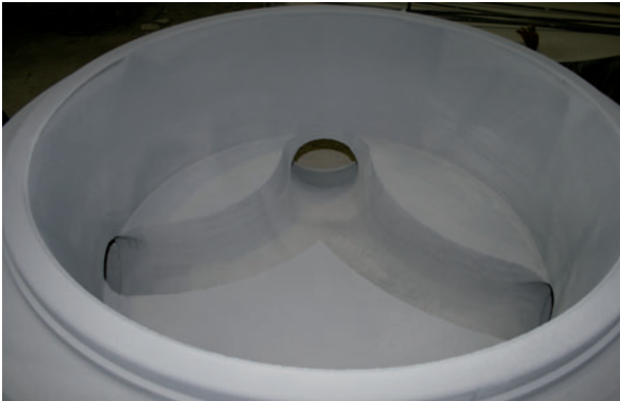
Finished concrete manhole base