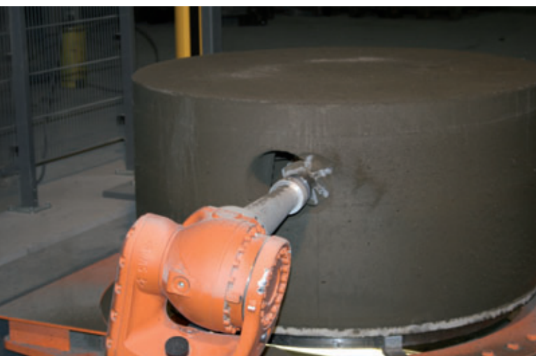
Milling the side connections

In the first step the robot mills the channels out of the monolith from below. A spherical milling head is used here. Once the channel is completed, the robot drives to the miller magazine and changes the