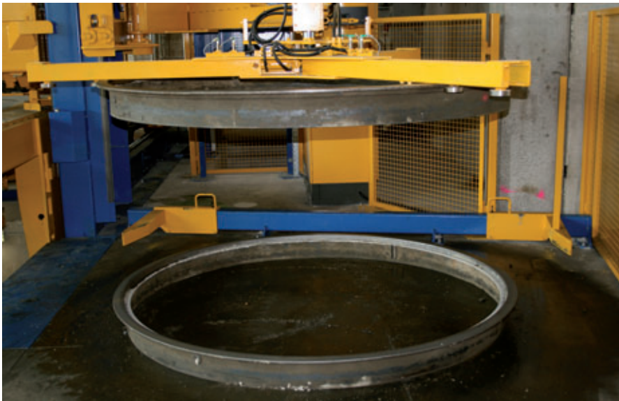
The automatic pallet insert device means the entire production system can be run by one man.