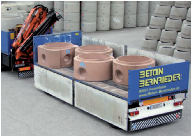
Tailor-made monolithic Perfect concrete manhole bases are produced from standard concrete C40/50 and from high-performance concrete C60/75.

ideal hydraulic course and correspondingly greater service life for the entire system. In this respect the hubs of the sewage systems - manhole bases - will in future be adapted 100% to the project requirements. Alongside the number and diameter, in future the engineer will also specify the angle and incline of the pipe connections required at the planning stage. Pipe connections up to DN1000 and manhole nominal widths of DN1000, DN1200 up to DN1500 are created in the Perfect production technology.