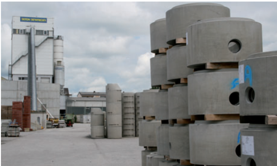
Perfect manhole bases are a common feature in the dispatch area at Betonwerk Bernrieder in Rosenheim since spring 2010.

The Beton Bernrieder family business in Rosenheim sees it as important to constantly gear its range and its in-house production programme to market requirements, to offer customers the very products and services actually required in construction. An important step in this strategy was taken in spring 2010 with the commissioning of a Perfect production system. The move to individual production of monolithic Concrete manhole bases up to a nominal width of DN1500 was the first phase in an investment programme to boost the market position of this traditional company. In the second phase production was switched to a new system for larger manhole components. The Magic2500 supplied by Schlüsselbauer means that manhole rings, cones and 3-chamber rings up to DN2500 can now be made.