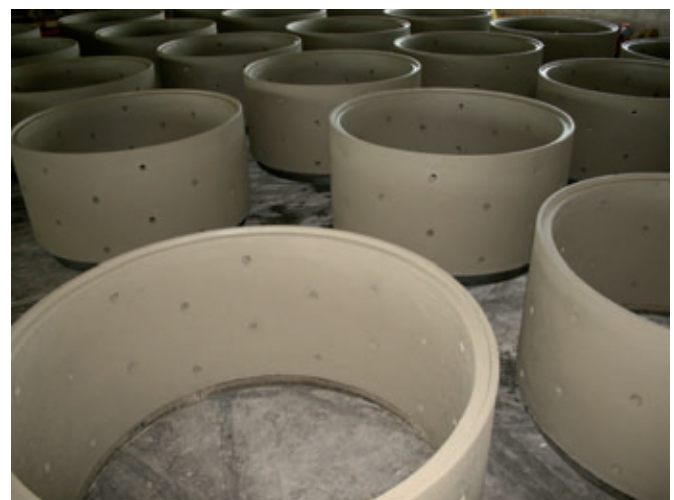
Drainage rings DN2500 in the hardening area.