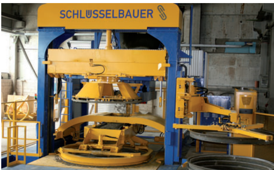
The Magic 2500 production system for the manufacture of precast elements with an external diameter of up to 2,700 mm.

The Magic2500 is a production system, on which large-format precast elements can be produced economically and with that flexibility so familiar to the Magic concept. The production capacity of the machine runs to an external diameter of 2,700 mm and a product weight of 3,000 kg. The Magic 2500 has a quick mould exchange system that allows the daily production programme to switch smoothly to other widths or products. The system can be converted in less than an hour with the result that significant output is guaranteed even if the production schedule has to be changed at short notice.