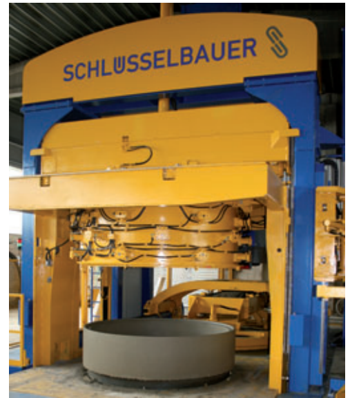
Large-format products in different building heights are produced in very short cycle times by the Magic 2500.

enhance the cost-effectiveness of producing large parts and the product quality is guaranteed at the level demanded by both the manufacturer and customers.