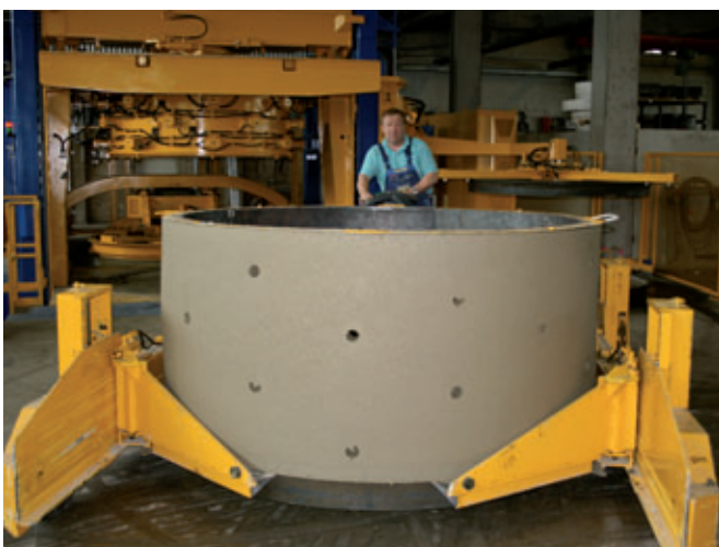
The products are removed from the system in an electrical cart.

ced as are garages and precast parts for bridge buildings. On the one hand, the wide range of production represents one of the company's success factors with fluctuations in demand in certain areas leading to a comparatively lower risk for the company itself, while on the other hand the wide range leads to increased demands for flexible production systems. With the two new production systems Perfect and Magic2500, Beton Bernrieder is excellently placed to meet these requirements. Flexibility for Beton Bernrieder however, is not just essential in its own production. In particular in duct construction, the objective is to make it possible for planners and decision-makers to install sewage lines with an