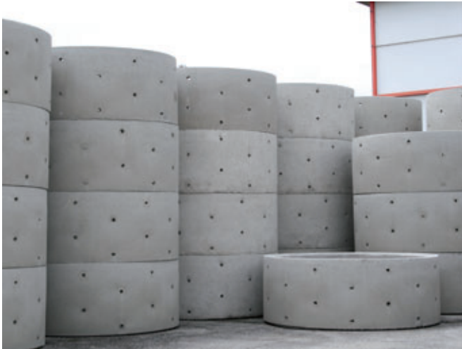
Drainage rings DN2500 in the outside store.