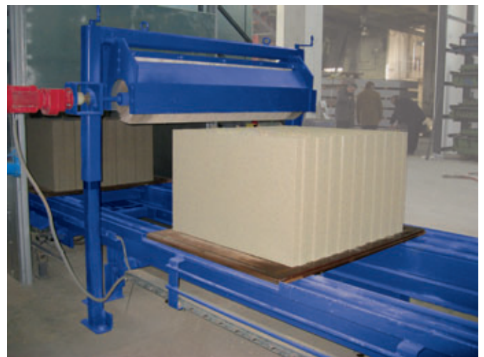
Products made on Masa XL 9.1 with aluminium vibration table, max. product size manufactured at present 1000 x 240 x 623 mm (length x width x height)