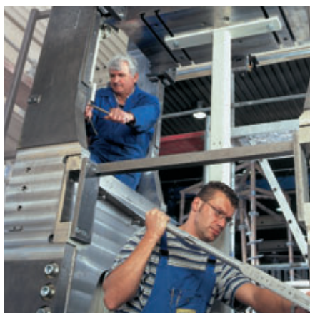
Assembly, Spare Parts and Service