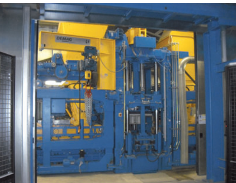
XL 9.1 block making machine

Over and above that, the machine can be manually operated locally with a so-called Tough Book. A Tough Book is a special laptop designed for industrial conditions that is connected wirelessly to the controller. For the production of products transversely to the filling direction, for example kerbstones, the machine is additionally equipped with a transverse cleaning device.