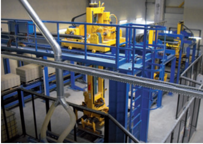
Dry side and packet assembly

Betonwerk Linden and Masa have together integrated outside conditions, new ideas and current trends in concrete block manufacturing in the project and in this way tailored it optimally to market requirements.