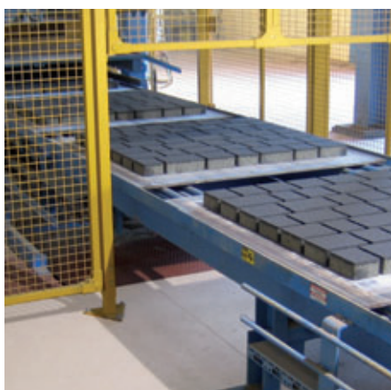
Plants for the manufacture of Concrete Blocks and Pavers