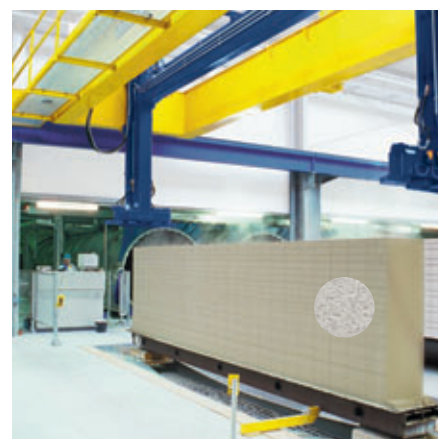
Plants for the manufacture of Aerated Concrete Blocks