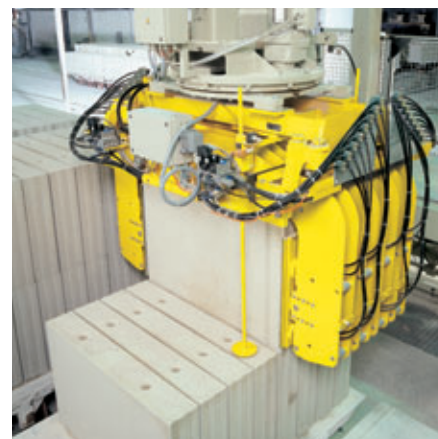
Plants for the manufacture of Sand-Lime Bricks and Blocks

Masa covers the complete range of machinery and ancillary equipment for the building materials industry: batching and mixing, concrete blocks/pavers, concrete slabs, sand lime bricks and aerated concrete.