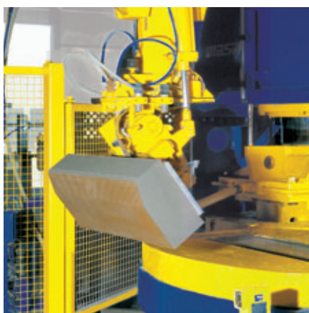
Plants for the manufacture of Kerbstones