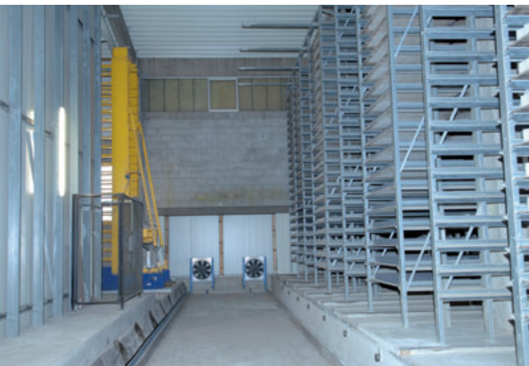
Lifter and rack system

The supplied plant meets the latest standards in concrete block manufacturing.