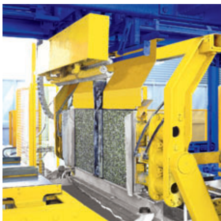
Plants for the manufacture of Concrete Slabs