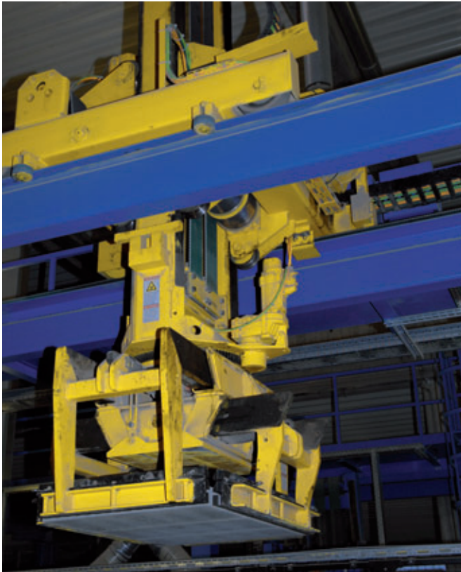
Servo packet assembler

During the BAUMA 2010, BWL Betonwerk Linden is available to MASA on one day (21/04/2010) for inspection. To this end, all interested parties are requested to send an e-mail to e.dreis@masa-ag.com or a fax to the fax number 0049 2632 9292 12. The interested parties will be informed of the exact procedure at a later date. Registration is necessary.