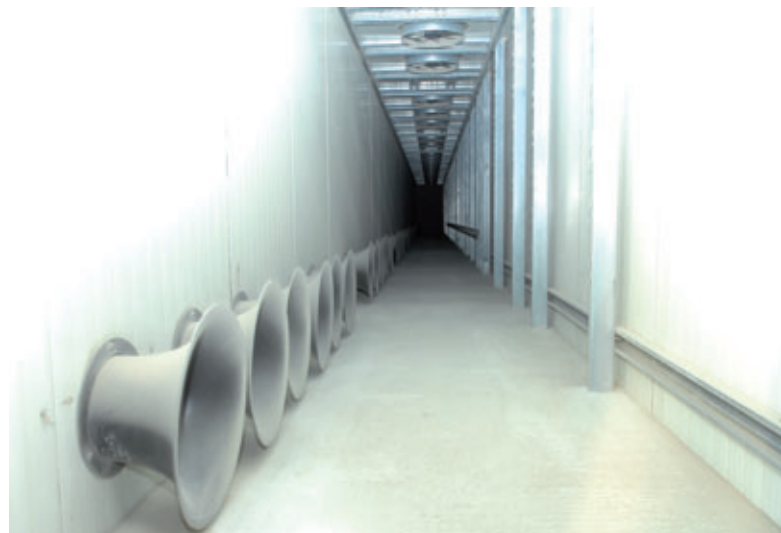
Ventilation system for large compartment