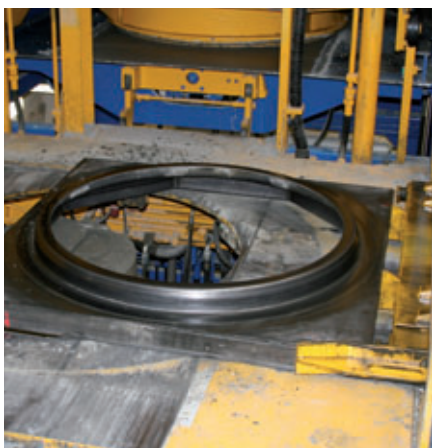
Automatic insertion of the pallets

The entire manhole part production at Tiba is operated by two employees. One employee runs all the activities around the current production and one colleague is responsible for the dry product side.