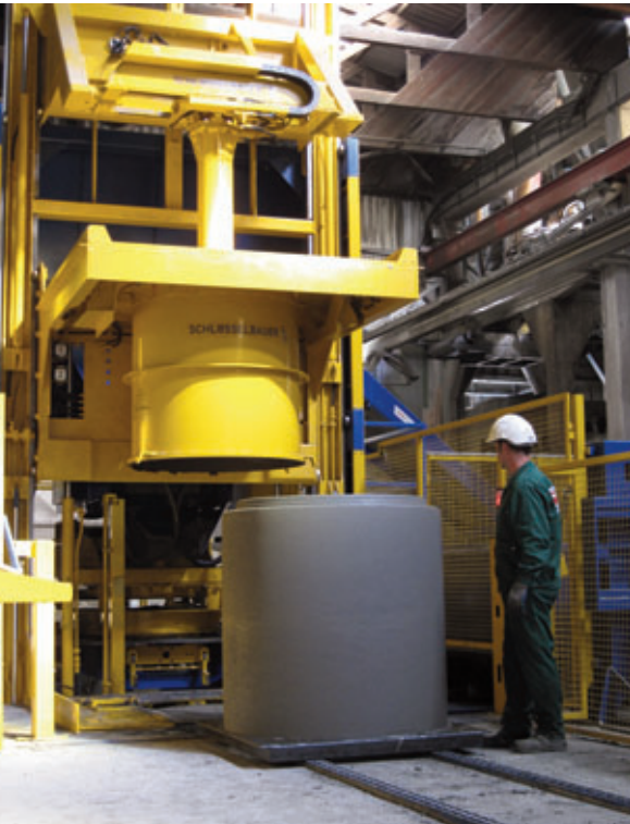
The MMagic is designed for product sizes up to Ø 820 externally in double production and up to Ø 1,800 mm externally in single production

The Magic 1501 is supplied with concrete by the mixers of Frühwald's existing concrete production, with the concrete being moved via a conveyor belt from the mixing plant to the production plant. The storage container is quite spacious and is large enough for several cycles and the mixing plant can produce concrete for other Tiba