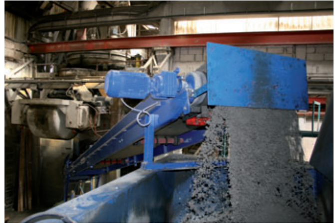
The Magic 1501 is supplied with concrete from the mixers of Frühwald's existing concrete production

these markets; Tiba has also been awarded the contract for a large infrastructure project in Kosovo this year, which is being funded in collaboration with the EU.