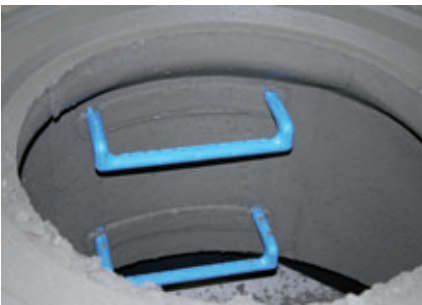
Fresh product with integrated steps

area. Here the simultaneous transport of several products is possible. By using the buffer zones of the Magic 1501, the machine operator can produce several cycles and then bring the accumulated manhole components together into the setting area.