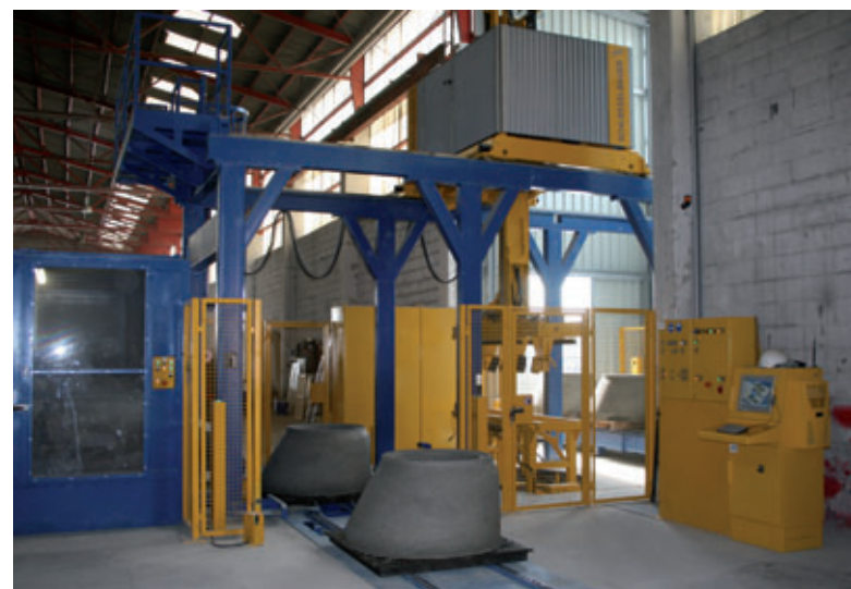
The hardened products from the previous day's production are moved to the loading station on the electric transport cart