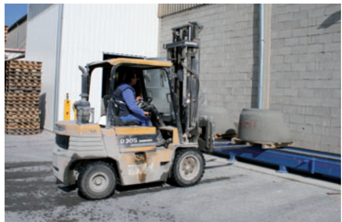
Forklifts are used to bring the concrete components to their temporary destinations in the external storage area