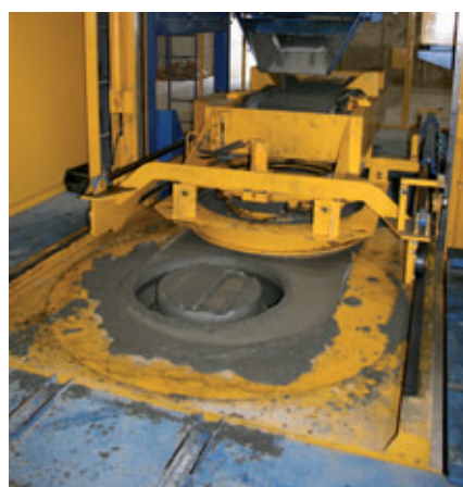
Filling and compression