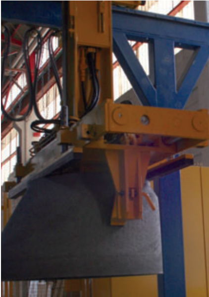
The crane uses a gripper to shift the manhole element