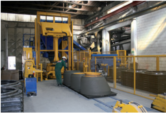
Magic 1501, to the right of the picture the pallet store in front of the oiling station