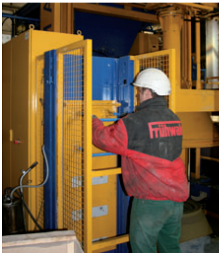
Inserting the steprungs into the Stepmaster

1,270 mm externally. The Magic is available in numerous different plant concepts, ranging from stationary production on a free-standing production machine with manual removal of the products through to a fully automatic circulation system. These include production, transport, storage of products, as well as cleaning and oiling of pallets.