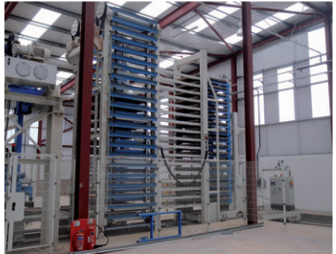
Dry side of the plant

either the dry side or the wet side to operate for approximately 4.5 hours without either filling or exhaust the buffer storage. One of the key words for this block paving plant is availability. A small but important detail is the production board de-stacking device. In a conventional production board de-stacking device the pallet is introduced to the production board conveyor from the bottom of a stack and a new stack cannot be fed into the de-stacking device until it is empty. Conveying a new stack into the de-stacking device takes more time than one production cycle. At every stack change the machine has to be stopped for approximately 8 seconds. In this project this delay is eliminated by the use of a different pallet feeding system. This gives Tobermore approximately 90 additional cycles per 8 hours shift.