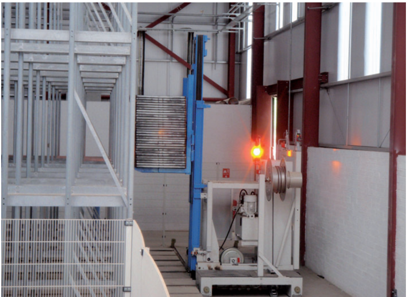
Pallet feeding system

The installation of a rack system with a storage capacity of 2880 empty production pallets supports this improvement. It is charged with 1440 pallets. This permits