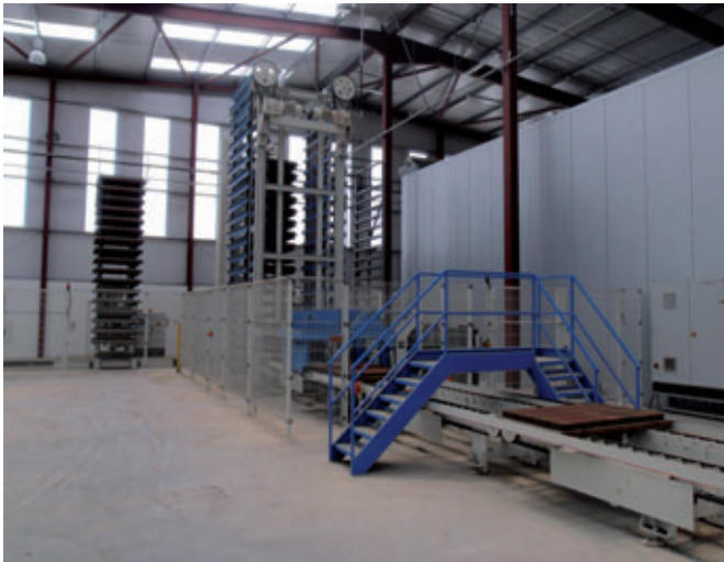
Wet side of the plant