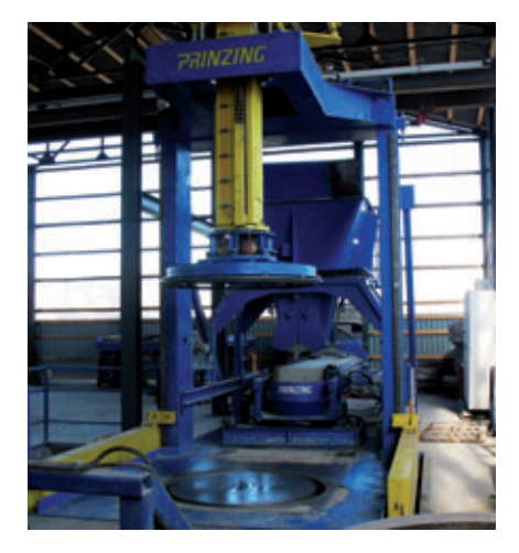
The Tornado 200/150 by Prinzing at Gelgaudiškio Gelžbetonis

The Gelgaudiškio Gelžbetonis company is located in Sakiu in Lithuania. The factory produces rings made of steel reinforced and unreinforced concrete, cover slabs, various compensating rings, kerbstones, slabs and concrete elements for agriculture and wastewater treatment technology. Special products are also manufactured according to customer requirements. An intensive modernisation of production has been carried out in recent years. Hence, a new concrete factory was built and a new automatic machine for the manufacture of manhole rings was purchased. The company opted for a Tornado T 200/150 by the German company Prinzing Anlagentechnik und Formenbau GmbH from Blaubeuren.