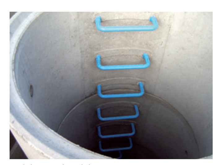
Manhole rings with manhole steps

The fact that the chosen Tornado machine is at the cutting edge of technology and has been providing service in hundreds of concrete plants in continuously further developed versions for more than 3 decades ultimately swayed his decision. An automatic concrete transport system by Dudik was installed along with the purchase and commissioning of the Tornado plant.