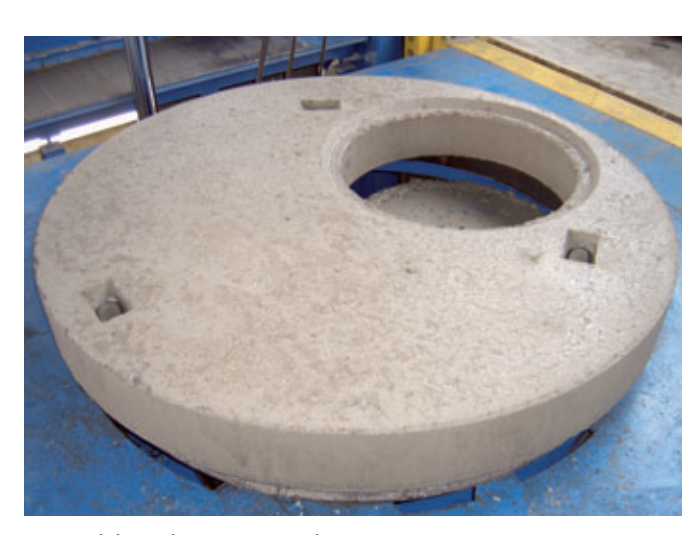
Cover slabs with transport anchors