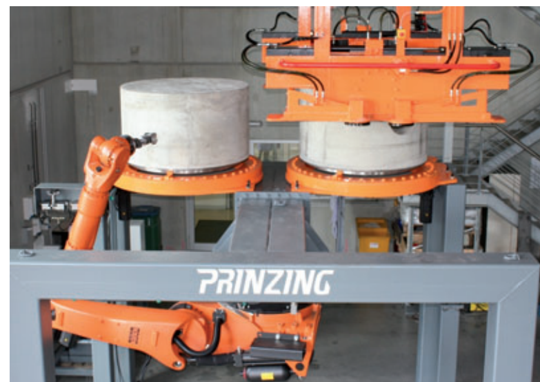
The monoliths, still resting on the steel end ring in a semi-cured state, are deposited at the milling bay and then centred with great precision