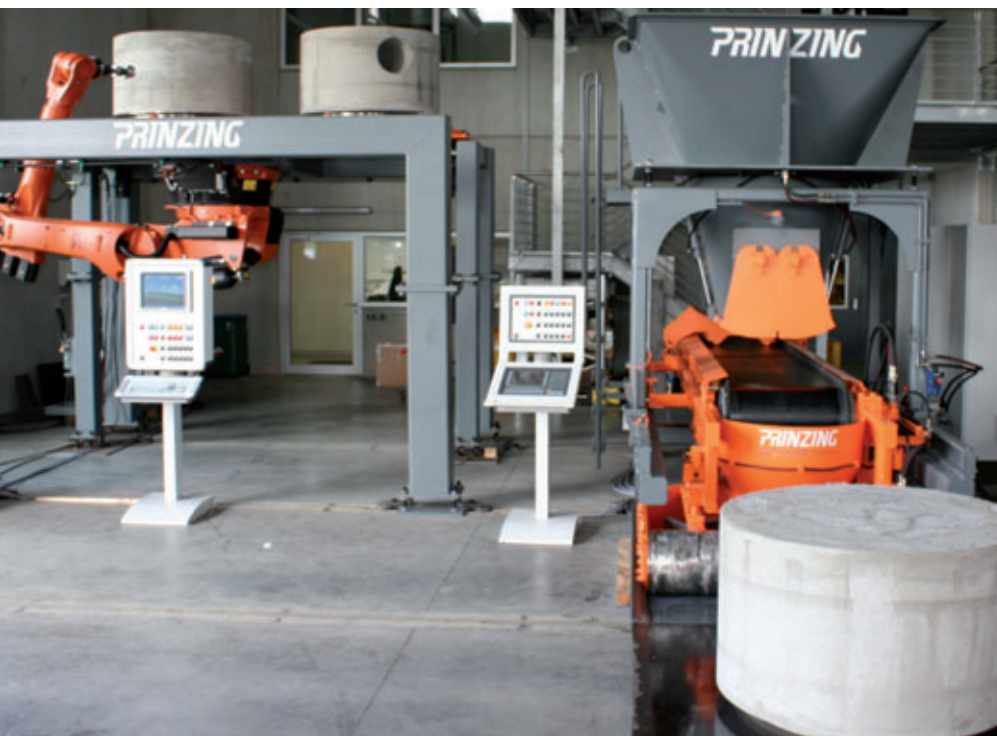
Producing monolithic manhole bases with the Primuss

Offers for manhole bases are issued in the sales department. Here, the customer is informed both about the monolithic construction method of Primuss manholes and the advantages of the optimum design of the drain channel course in terms of flow technology. This avoids blockages and turbulence plus protects the channel from damaging deposits. The manhole bases are made up entirely of concrete and all common types of pipes can be connected to them. Their corresponding sealing rings are firmly