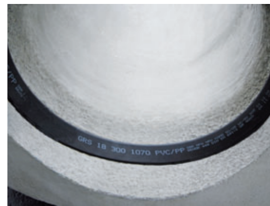
All seals for the connections are glued in place with a polymer adhesive in the recess provided