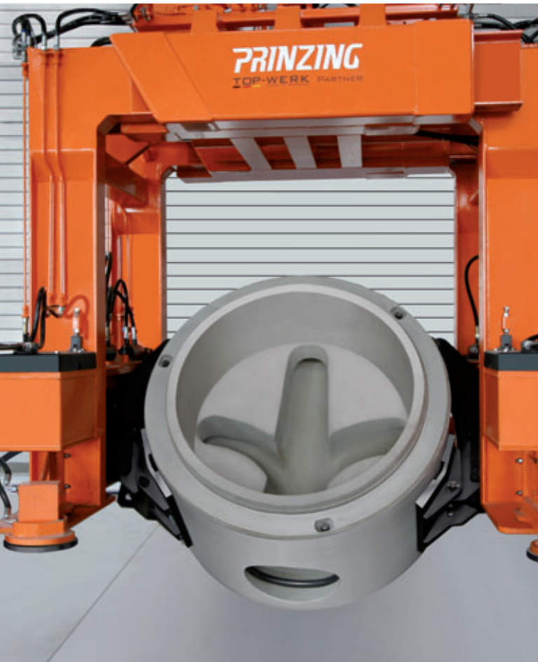
Right after the milling stage, the manhole bases are turned to their normal position

built into the pipes' ends. When an order is made, all manhole parameters are fed in with the aid of an ERP system. The computer carries out a plausibility check automatically. The customer then receives the manhole data by fax for checking and confirmation. Production is planned and carried out on the basis of order data and delivery times.