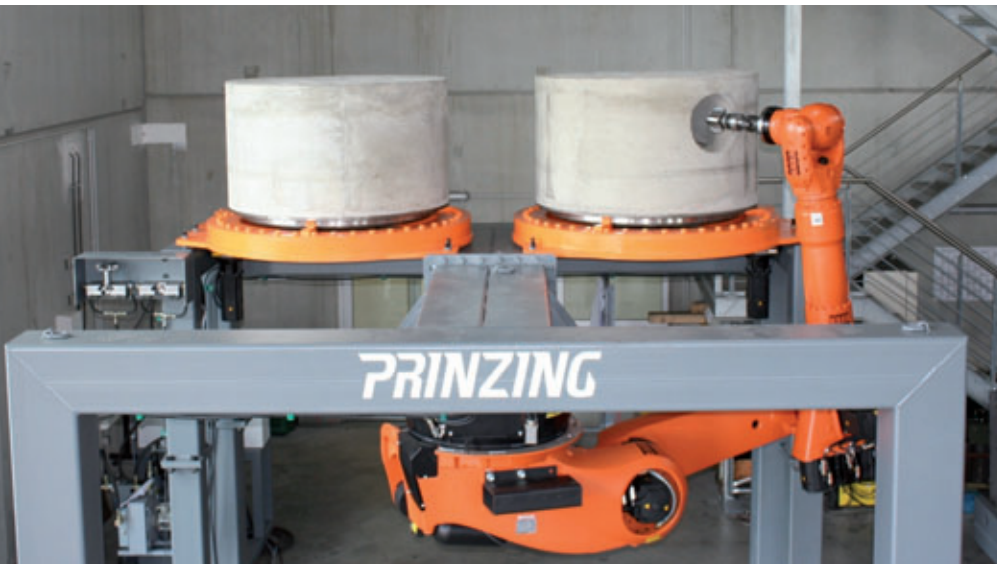
Connections are milled from outside

DS Dichtungstechnik GmbH Lise-Meitner-Straße 1 48301 Nottuln, Germany T + 49 2502 23070 F + 49 2502 230730 info@dsseals.com www.dsseals.com