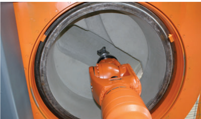
Channels are milled out from below

It is well-known from mechanical engineering that components can be manufactured with the greatest precision when all processing stages can take place in a clamped down state. In accordance with this principle, the monoliths are deposited at the milling bay and then centred with great precision still resting on the steel end ring in a semi-cured state. The monolith's own weight generates a firm connection to the milling machine's rotary axis so that no additional means of clamping are needed. The milling bay has two processing