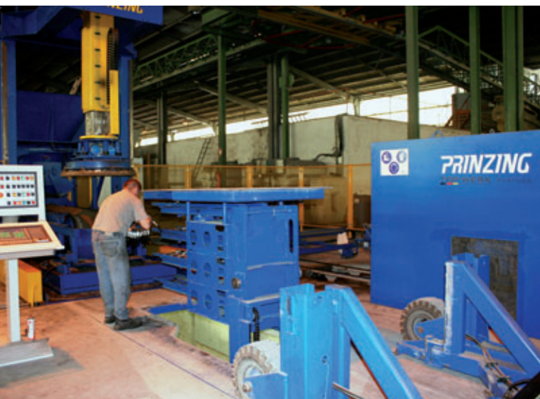
Filling up the manhole step magazine

The sturdy Tornado production plant, made by Prinzing, was precisely what the Sarbeton management, which places importance on great flexibility and proven tech-