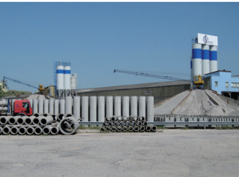
The Sarbeton company in Keskastel, France