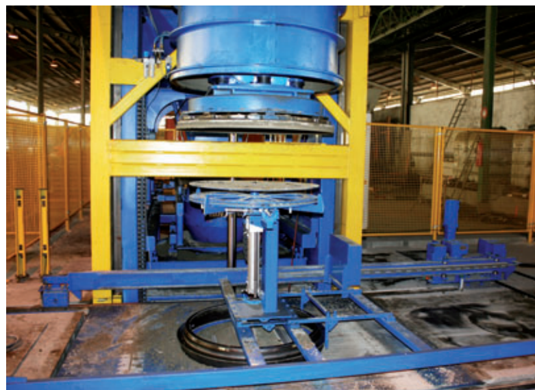
Automatic insertion of transport anchors