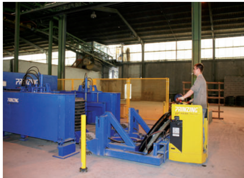
Feeding the steel pallets

Sarbeton had precise ideas about how a production plant for the existing product range should look. The most powerful possible, flexible, space-saving plant was to be used for the production of manhole rings and cones. The Tornado by Prinzing meets