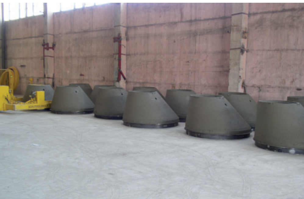
Cones in the curing area of the production building at OOO <<SMK-50>>