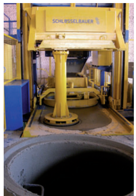
Production cycle: Pallet is fed in, mould filled and after compacting the cone is released from the mould and transported out of the machine.