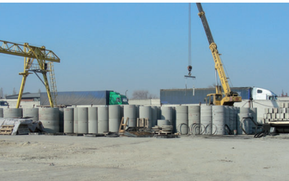
Manhole elements in the loading area at OOO <<SMK-50>>

“Every serious building plan is on the one hand based on an analysis of the situation however on the other hand conceived to achieve the human desire to improve the