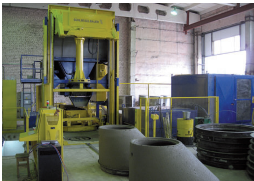
Production of manhole cones at OOO <<SMK-50>> using the new production plant Magic from the company Schlüsselbauer.