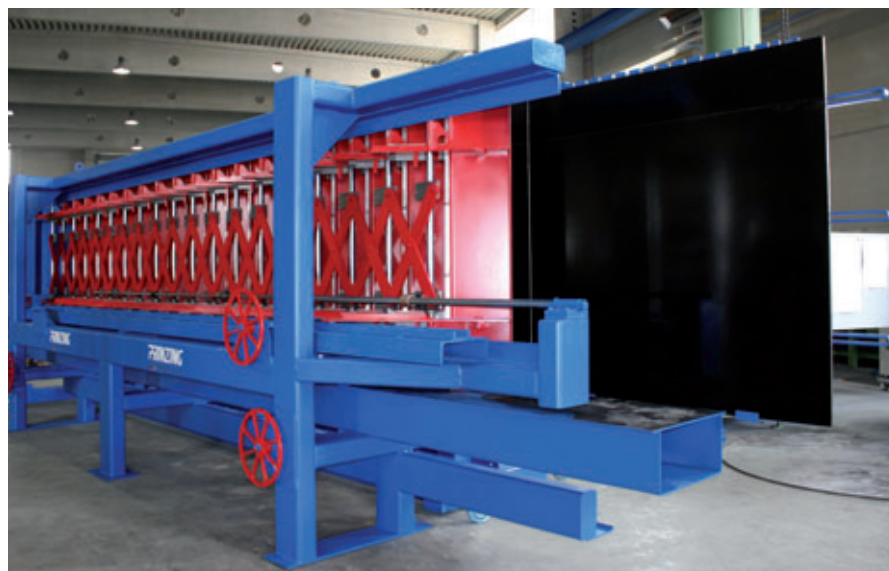
Adjustable staircase formwork system for straight concrete precast staircases

also be adjusted infinitely in the shortest space of time via guides. A further novelty of the staircase formwork with the type designation Sirius is the upper and lower landings, which are manufactured in one work step together with the staircase.