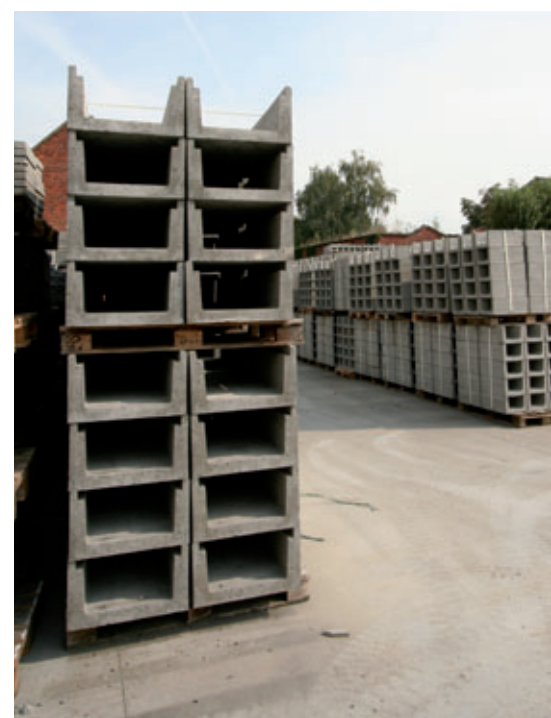
Cable ducts for the Belgian railway

The Blizzard turning system supplied by Prinzing for stationary production is largely automated and is used to produce sophisticated concrete products and precast. The turning process also enables products which previously required labour-intensive manual processes using vibration tables or moulds to be manufactured automatically. The Blizzard maximises the efficiency of producing drainage channels, cable ducts, covers, frame elements, pot elements and manhole bases and the entire plant is designed to be operated by just one person. Servo-controlled removal and placement of products in the curing rack, servo-controlled de-stacking onto Europallets and the strap-