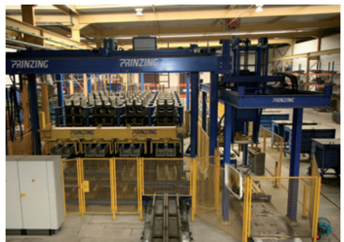
The ingenious design of the crane robot and rack system means that only a small amount of room is required for the entire plant