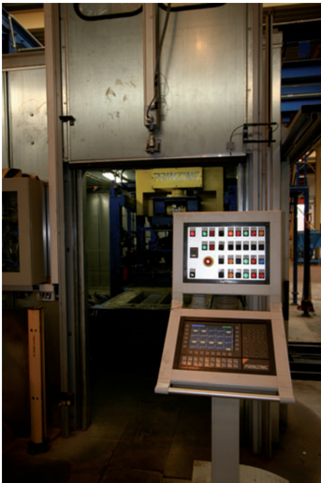
All the production parameters can be viewed on the control desk monitors

ping and transport of finished product packets on Europallets from the hall are all fully automated.