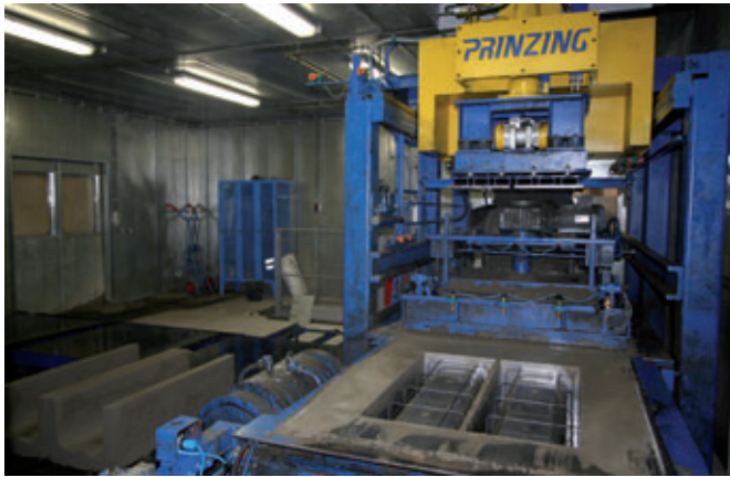
Low-noise pollution due to sound-insulated production with the Blizzard