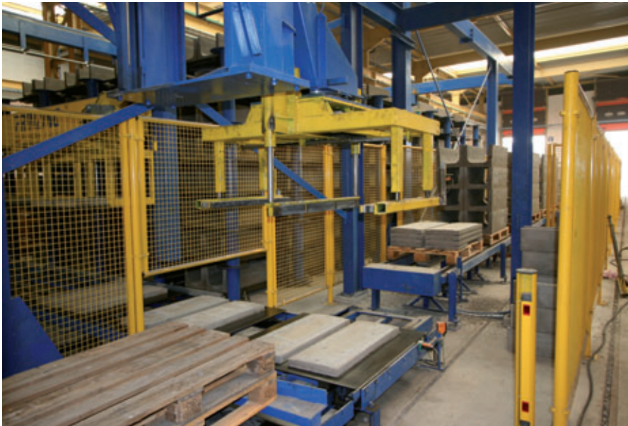
Packaging different products is no problem for this brilliantly designed system