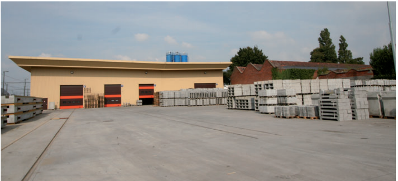
The Infrabel concrete production facility in Roeselare featuring the latest equipment

The first railway connection in Belgium was put into operation between the cities of Brussels and Malines on 5 May 1835. This stretch, which was then operated with steam locomotives, has since developed into one of the most up-to-date and complex railway systems in Europe with an overall length of 3,536 kilometers including high-speed sections for trains travelling at speeds up to 300 km/h. Having administered the Belgian railway infrastructure since 1 January 2005, Infrabel relies on its state-of-the-art concrete production facility in Roeselare to produce almost all the precast required for the Belgian railway, except for the concrete sleepers. The main products are cable ducts, concrete pits, platform edges and concrete blocks for railway overpasses. An automatic production machine for cable ducts and covers, a Blizzard from Prinzing GmbH, Blaubeuren in Germany, was purchased in 2007 and accounts for the high degree of automation of the production cycle.