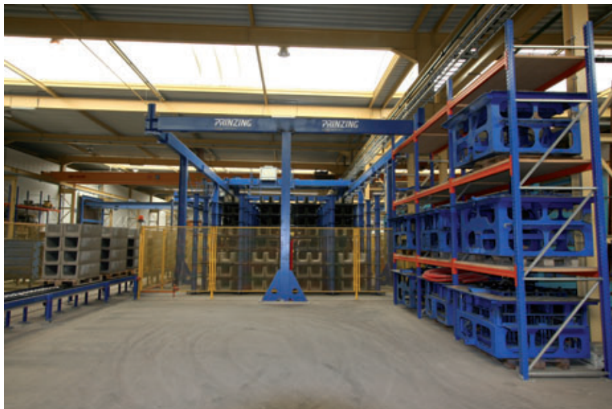
At Roeselare, the plant was designed to allow the curing rack to be enlarged to cater for possible two-shift operation

mance vibrating tables of the Blizzard in Belgium are therefore fitted with a new, continuous-amplitude controller.