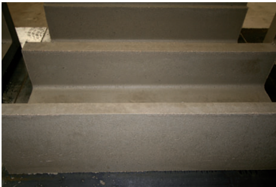
Impressive external appearance of the Roeselare cable ducts

Supplied by a skip conveyor, Infrabel's Blizzard places the concrete in the mould and compacts it on the high-performance vibrating table, subsequently de-moulding the fresh products onto the steel pallets by means of the special turning process. The steel pallets used at Roeselare are 1.20 x 1.20 m. During the turning process, the pallets are only used to support and store the fresh concrete products. Since the steel pallets are not supplied to the production circuit until compaction is finished, they are not exposed to the high forces during vibration.