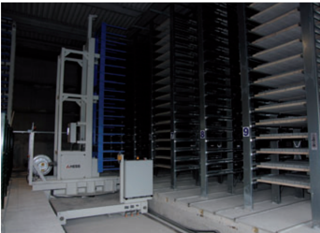
Fig. 3: The finger car takes the production boards to the Rotho curing rack installed opposite the plant

The packet assembler has servo drives for lifting, driving and the rotary movement. Instead of chains, maintenance-free toothed belts are used, as they have been in all Hess packet assemblers for years. The clasps are hydraulically controlled and compulsorily synchronised via gear racks. The use of a hydraulic rotary distributor is not necessary, since the hydraulic hoses are rotated with the lifting mast over its entire length. This prevents the block surfaces from being contaminated by dripping hydraulic oil.