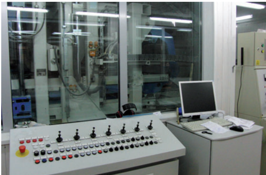
Fig. 2: The heart of the plant is a Hess RH 1500-2 VA with a board size of 1400 x 950 mm

Influenced by positive market developments and Slovenia's impending entry to the EU in 2004, initial investigations had already been carried out in 2002 with a view to expanding and renewing the production facilities. The project was substantiated at the BAUMA 2004. It was clear how the plant should be technically laid out. After speaking to several manufacturers, the Jarc family decided to implement the project together with the companies Oru (expansion of the existing mixing plant) and Hess Maschinenfabrik (delivery of a new concrete block making circulating plant). The most important reasons for the decision were a significant increase in the quality of the products and an expansion of the product range.