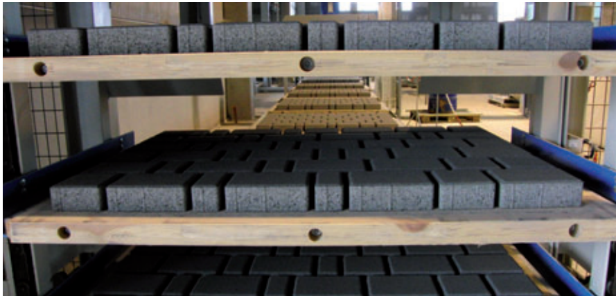
Fig. 4a: The cured products are in turn transferred by the finger car to the lowering ladder