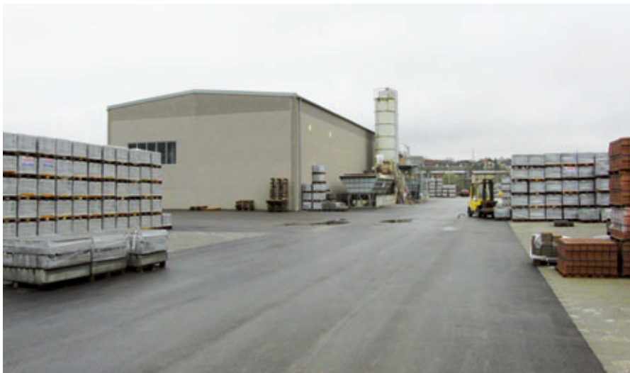
Fig. 1: Cementni Izdelki Jarc's production site in Medvode, Slovenia