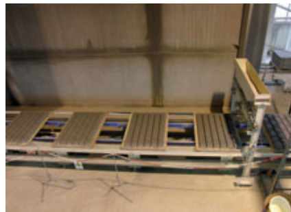
Fig. 4b/c: After separation, the products are transported to the packet assembler by an accumulation pawl conveyor

After the blocks have been destacked, the manufacturing boards are cleaned with a brush, turned by 180 degrees and then returned to the board magazine of the machine via a transverse conveyor. All operating controls are housed in a soundproofed control booth. The control