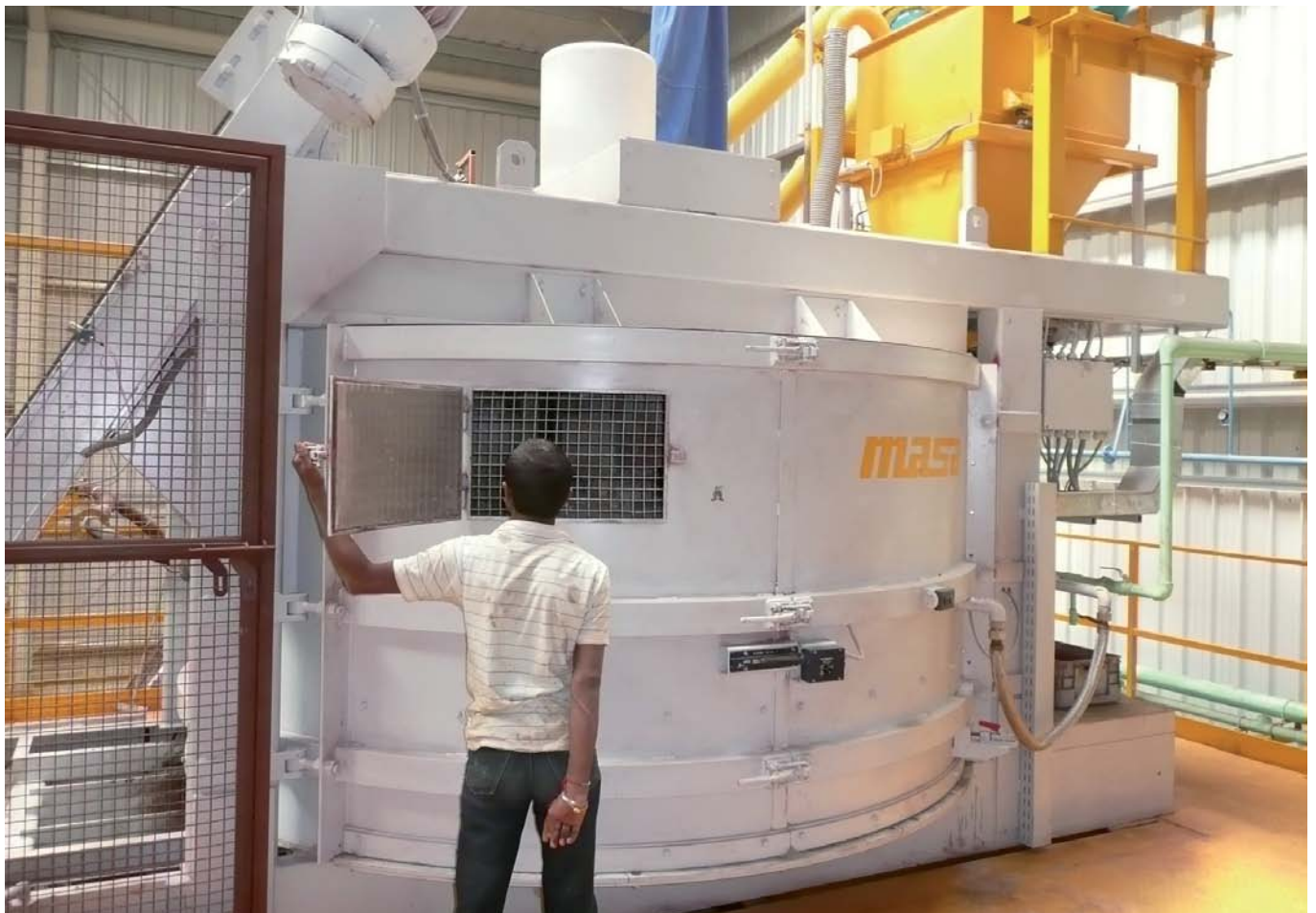
Two concrete mixers by Masa produce the facing and core concrete for the block production

that, above all, should include premium concrete products, such as refined interlocking pavers, grass pavers, all other products for garden and landscape construction, and decorative washed concrete blocks. One of the Indian's highest maxims is to strive for products with a high aesthetic value that clearly stand out from the crowd on the market.