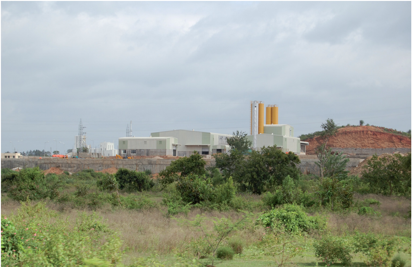
Building ground for Basant Betons