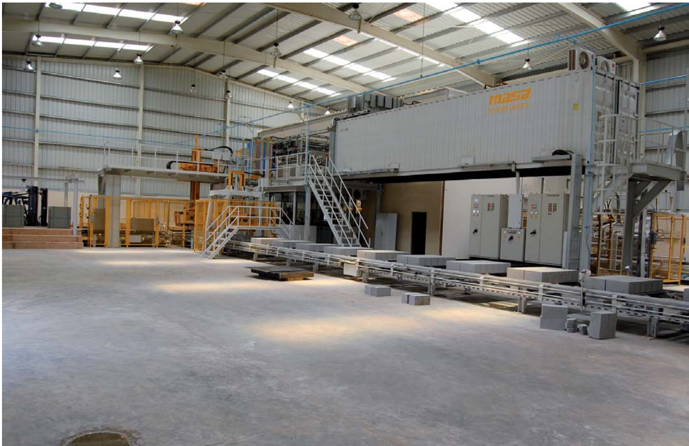
All of the electrical control cabinets for the entire block making plant are housed in a single container, which Masa calls the Powertainer.

journeys and speedy completion of the building work, and typical of Indian building sites.