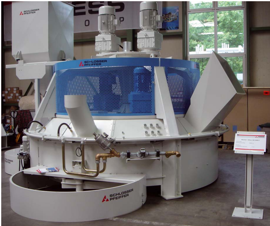
At the in-house exhibition the SM 3000-2 mixer model was presented with a new, modularised design that enables shorter delivery times and even more attractive prices.

On the occasion of its annual in-house exhibition on 13 and 14 June 2008, the Hess Group presented its current product portfolio and the new Cutmaster for masonry blocks with perfectly flat surfaces. A record number of more than 500 guests from Germany and abroad attended the event.