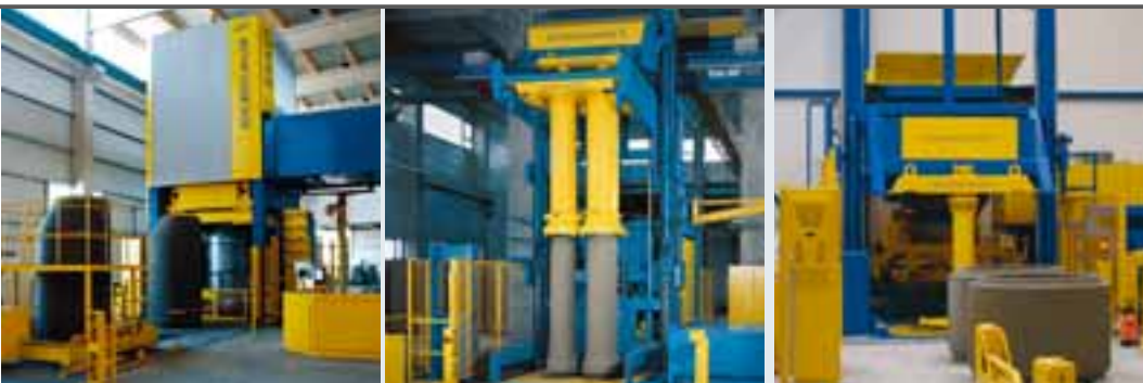
Production plants for pipes, manhole components and special parts

The cured manhole components are automatically tested on density by means of vacuum before they are marked and labeled and afterwards transferred to the outdoor stock on a conveyor. Currently Plattard produces 150 manholes with a height of 1,50 m per shift in 7 hours. This conforms to a cycle time of 3 minutes which of course decreases when producing smaller manhole components.