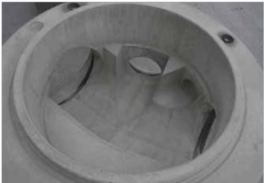
Any individual mould can be realized with the manhole base production system Perfect

Currently Plattard produces with the new production system Perfect appr. 45 custom-made components a day which can be dismantled and delivered after a curing period of one day. The polystyrene leavings which remain after the final dismantling of the manhole bases have a very special value for Plattard. The polystyrene material is processed and packed into big bags so that it can be of further use in several fields of the building materi-