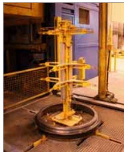
Before the production of the manhole risers starts, the pallets, the hoops, the lifting anchors and step rungs are automatically positioned.