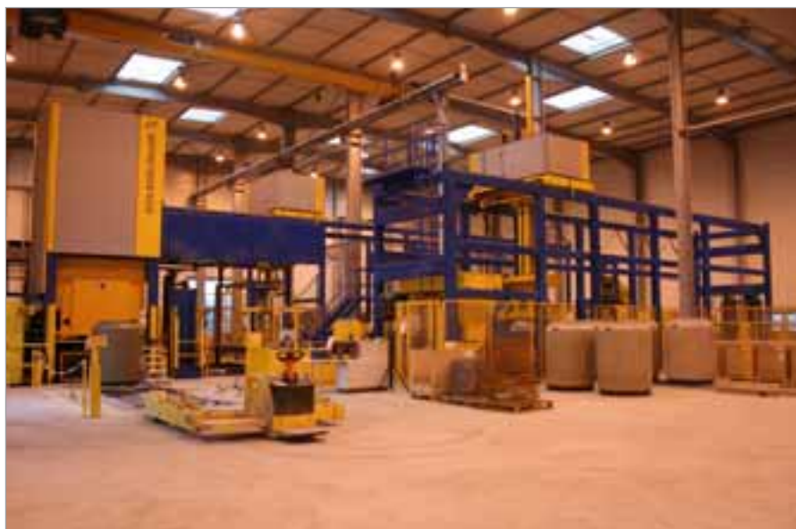
At Plattard in Villefranche, France, a brand-new Exact manhole production plant has been started up recently.

When they decided to significantly increase the production capacity of the manhole production plants in 2005, they chose the unique complete system offered by company Schlüsselbauer of Gaspoltshofen, Austria. With a combination of Exact manhole risers with integrated taper and Perfect manhole bases with integrated channel made of concrete the time of installation on the construction site is decreased by simultaneously increasing the added value of the concrete factory. It wasn't difficult for Jacques Plattard to make this decision as he attaches great importance to the quality of his products: "High quality is worth its price. The invest-