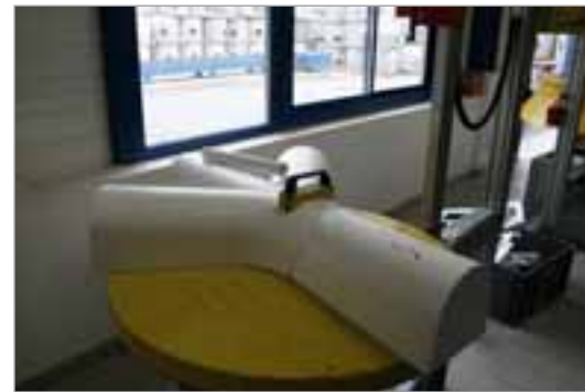
When preparing the production of the manhole bases, mould pieces are cut out of polystyrene by a hot wire so that all curves fit perfectly together when the individual parts are put together.