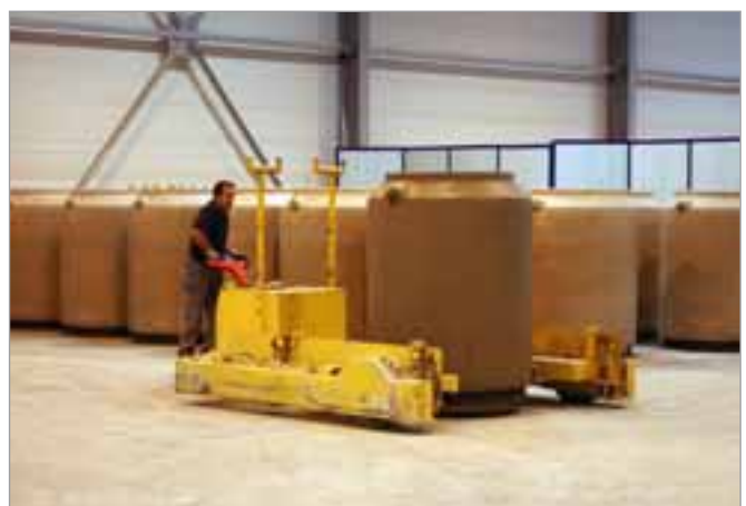
An electrical transporter transfers the manhole components to the curing area.

For the new Exact 2500 manhole production plant a complete new hall has been built, which has a floor of 100 x 35 m and a height of 12m. Beside the new Exact production plant also an exi-