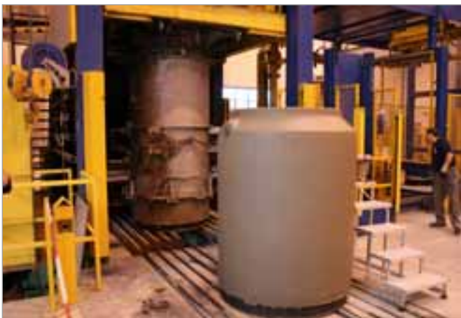
The manhole components are dismantled immediately after the production

ment in the machines and plants is high but from the beginning we were convinced that this investment will be worthwhile for all participants. Besides it is the enormous advance of innovation which we have due to the investment in this plant. We are proud of being one of the leaders in technology here in France."