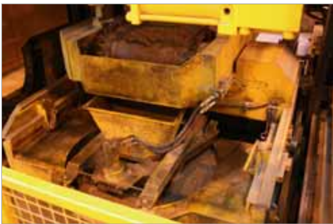
The concrete is transferred to the production plant via a conveyor.

ment in the machines and plants is high but from the beginning we were convinced that this investment will be worthwhile for all participants. Besides it is the enormous advance of innovation which we have due to the investment in this plant. We are proud of being one of the leaders in technology here in France."