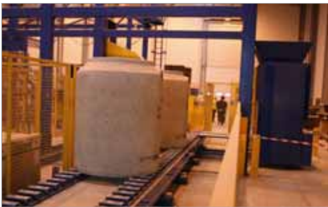
The manhole components are tested on density by means of vacuum before they are transferred to the outdoor stock on a conveyor.