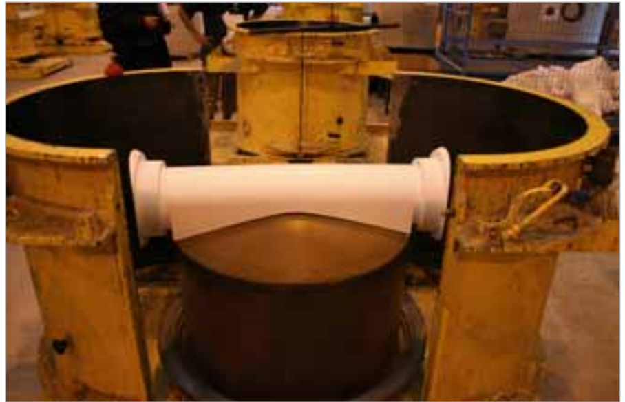
The finished mould parts are placed into the prepared moulds for the manhole bases.

When using the production system Perfect individual channel inclines, inlets and outlets in different positions and sizes are pre-