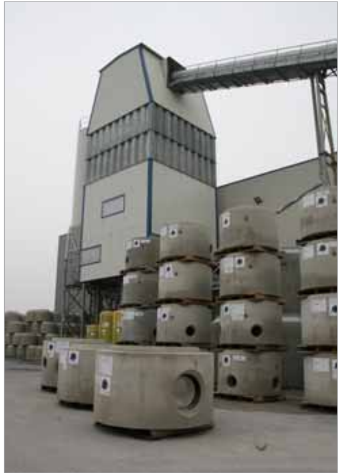
In order to be self-sustaining each hall at Plattard disposes of an own mixer for concrete.