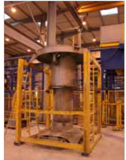
At a mould exchange the moulds are prepared in special boxes over-ground.

It is possible to produce manhole constructions with 300 to 2.400 mm length on the Exact plant - if necessary also including taper. The manholes at Plattard usually have a diameter of 800 or 1.000 mm. If required the step rungs can be directly vibrated into the products and on the spigot end of the manhole components a hoop is incorporated. The step rungs are positioned with the Stepmaster, a robot which was created by Schlüsselbauer especially for this intended use. The lifting anchors of the manhole components are also automatically integrated. Hereby the anchors are hold in the specified position by an electro powered magnet and only released when the product is dismantled.