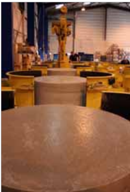
After one day the manhole bases which were produced the day before are dismantled.

The solution to transfer the concrete via a conveyor within the plant is really uncommon – but it works very well due to the short distances and the high velocity of the conveyor.