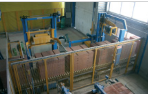
The block packets are strapped by means of a strapping unit made by the Ridder company