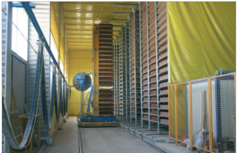
The fully automatic moving platform loads and unloads the shelving unit automatically

In accordance with the market requirements mentioned at the beginning, it was particularly important to obtain a concrete block machine that can achieve the highest product quality for the highest daily production quantities. It needed to be possible to manufacture paving stones, kerbstones and all other garden and landscaping products in a constantly high quality.