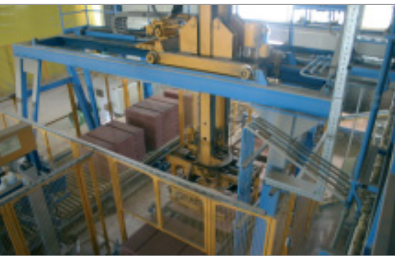
The layers of blocks are made into packets in the cuber