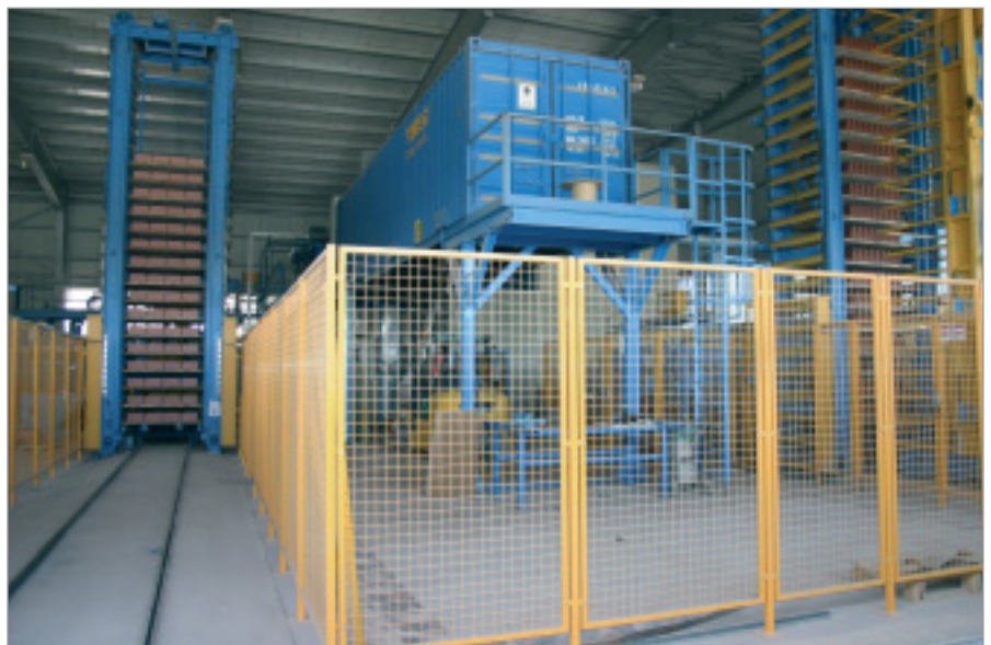
All controllers are pre-installed in the 40' container, which Masa call the 'Powertainer'

When the concrete has been fully mixed, it is taken up by the bucket conveyor and transported to the block production