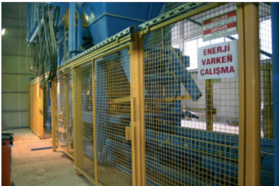
The block forming machine at Özkul is fenced off as required by safety regulations