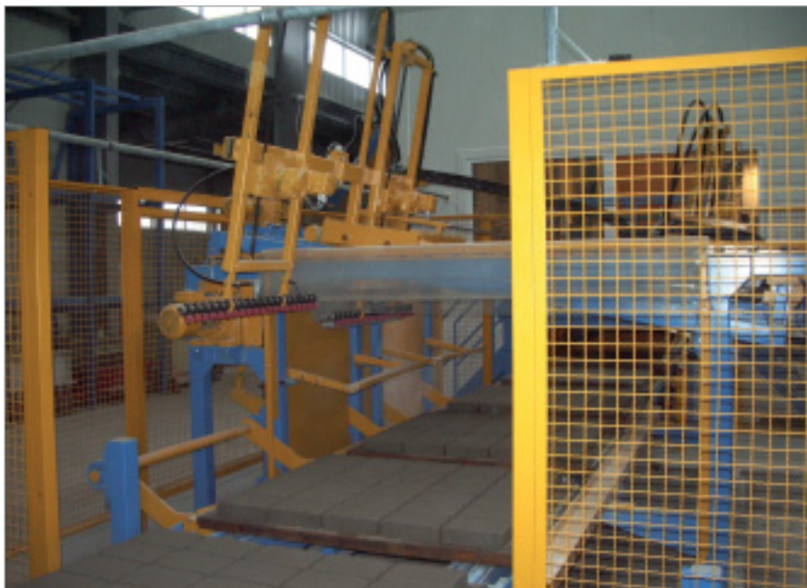
The concrete blocks produced by the machine are transported to the lifting rack by means of a lowering device and a free lift conveyor.

The basic structure of the cuber consists of a portal frame of robust profile steel. The distortion free chassis is driven by a toothed rack and a frequency-controlled special gear motor.