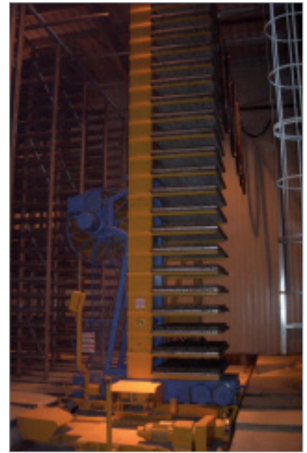
The fully automatic, rotating moving platform loads and unloads the HS shelving installation, which was designed as a closed system with recirculating air equipment.

The concrete blocks are stored in the shelving units for hardening by means of a fully-automatic moving platform, which is rotatable. This plant, manufactured from