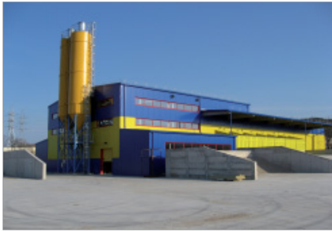
The exterior colour scheme of Musu Statyba's factory in Kaunas, Lithuania, hints at the supplier of the machines and plants inside.

The rising and lowering movement is carried out by twin-action lifting cylinder. The grab and clamp equipment, which can be rotated by 360°, is designed as a hydraulically-driven four-sided cramping device.