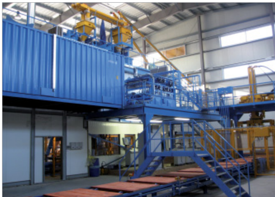
The mixing and dosing plant is located directly above the concrete block machine.

The Record 9001 VB is a stationary, fully-automatic universal block-making machine for mass production of concrete blocks