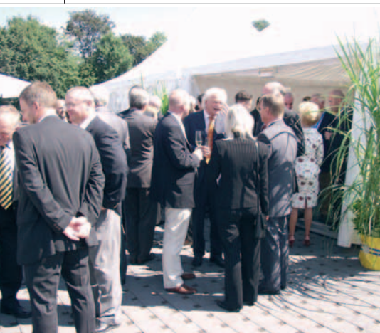
Lively discussions in the glorious summer weather during a presentation break