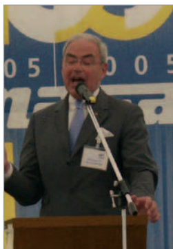
Minister of Finance, Gernot Mittler makes his speech with some elements which are reminiscent of an election campaign