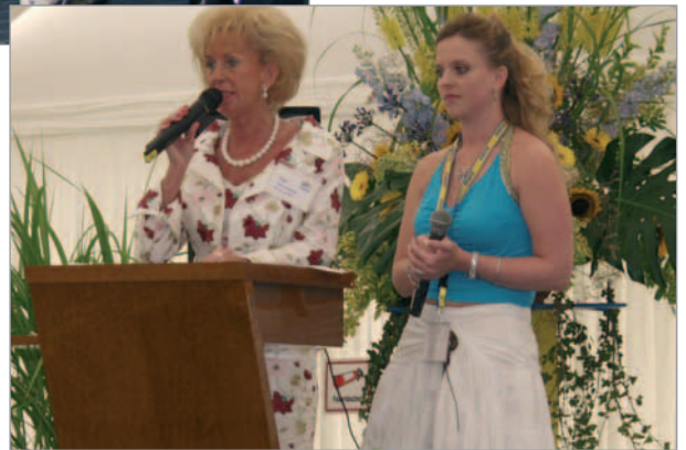
The proprietress with her daughter during the welcome speech