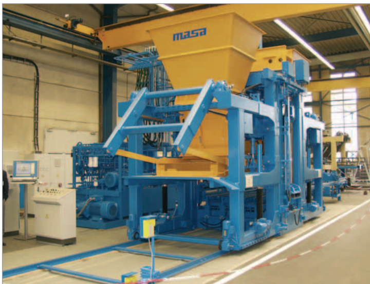
View into the plant halls with machines awaiting dispatch to destinations all over the world