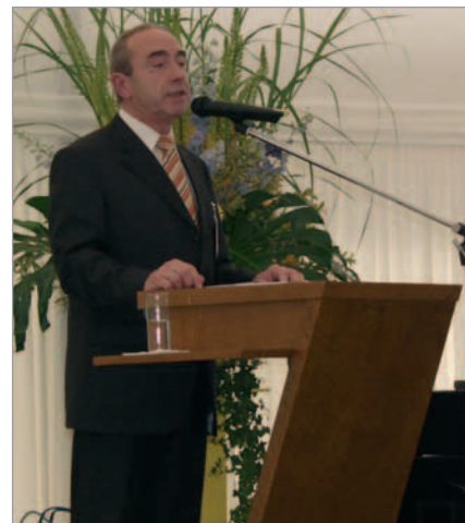
The mayor of Andernach pays tribute to the relationship between MASA and the town

He expressed the hope that the human factor of Masa would continue to be important in the future so that the next 100 years could also be looked at with confidence. The 100th anniversary was splendidly concluded with a trip on the romantic river Rhine from Andernach to Braubach which had as its climax the world-famous fireworks "Rhine in flames" over the "German corner" in Koblenz followed by a gala diner. ■